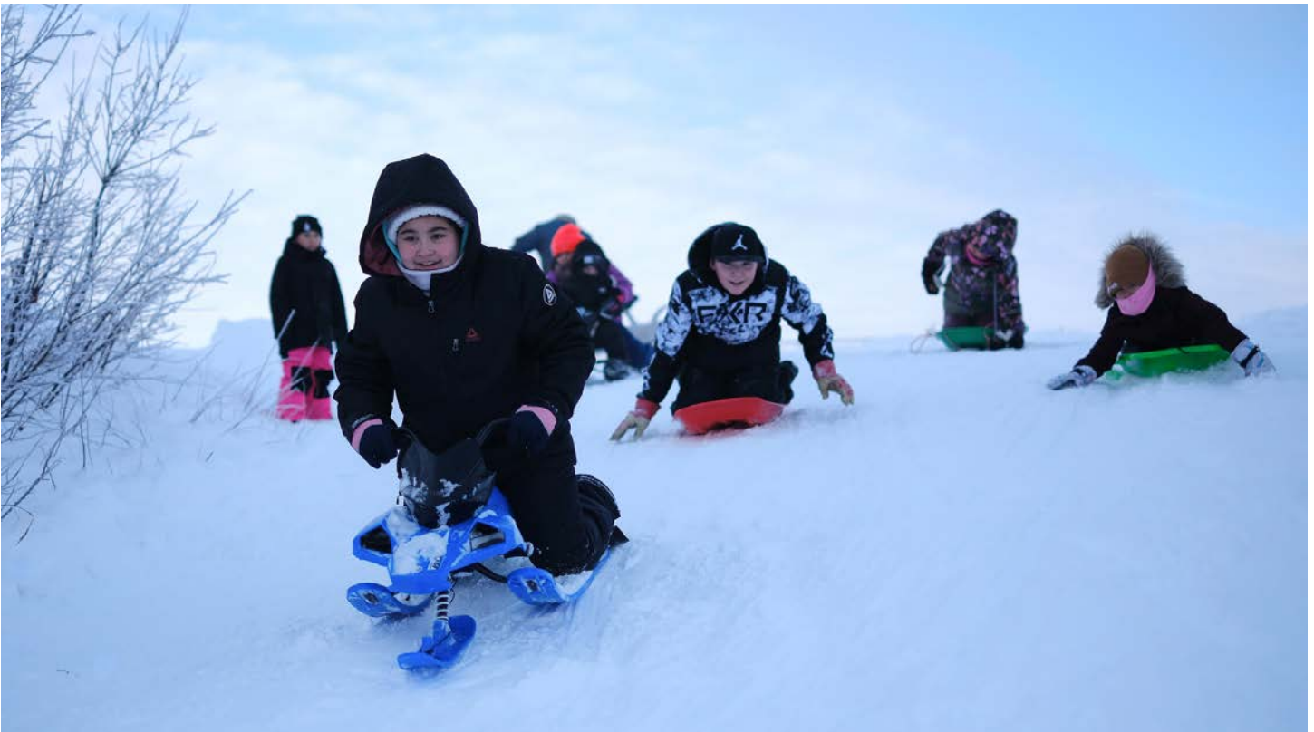
Sliding fun at the Slough! See the community photo galleries on pages 7-14.