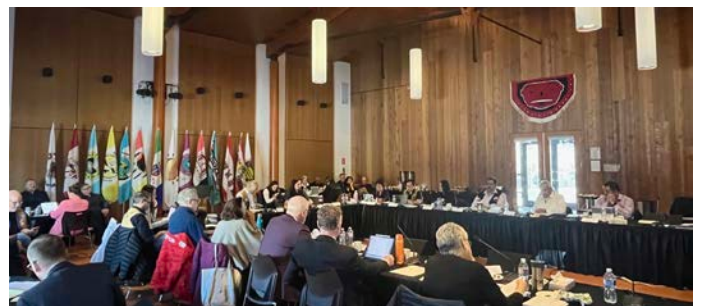
The Yukon Forum. February 16, 2024.