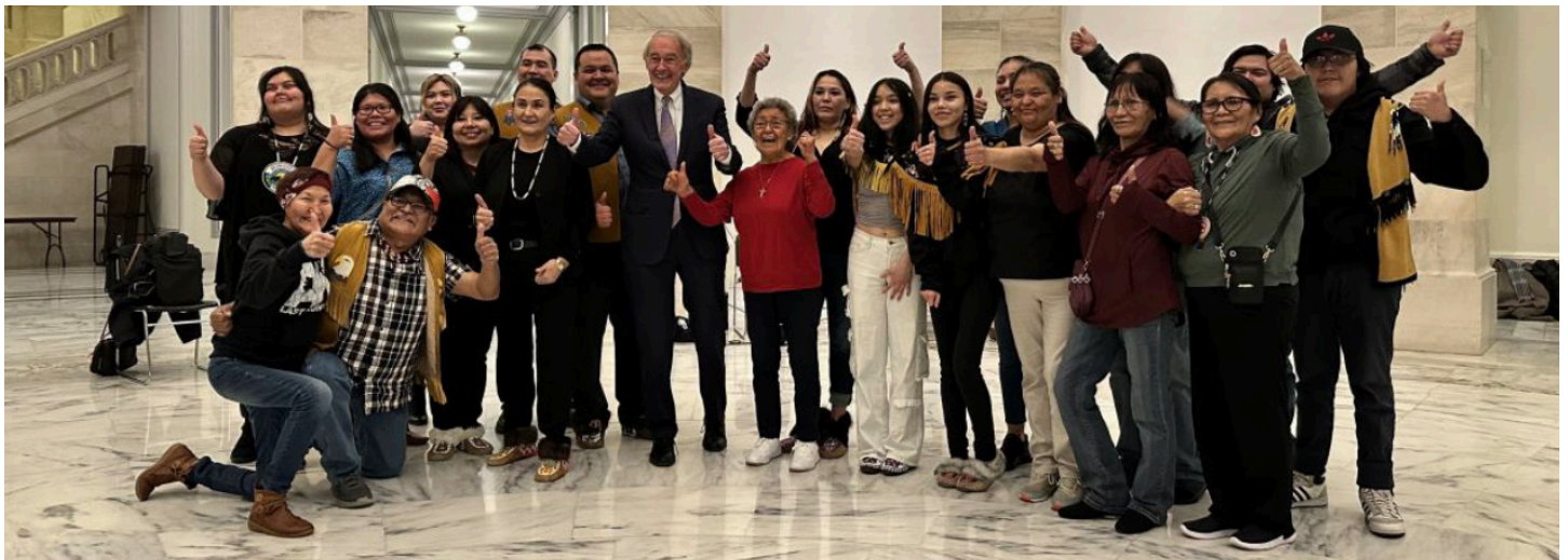
The delegation in Washington D.C. celebrating the 63rd Anniversary of the designation of the Arctic National Wildlife Refuge with Senator Ed Markey (Mass.), advocate for protecting the Arctic National Wildlife Refuge in the U.S. Senate and sponsor of S.282 Arctic Refuge Protection Act which would designate the Coastal Plain as wilderness (Dec 6, 2023).