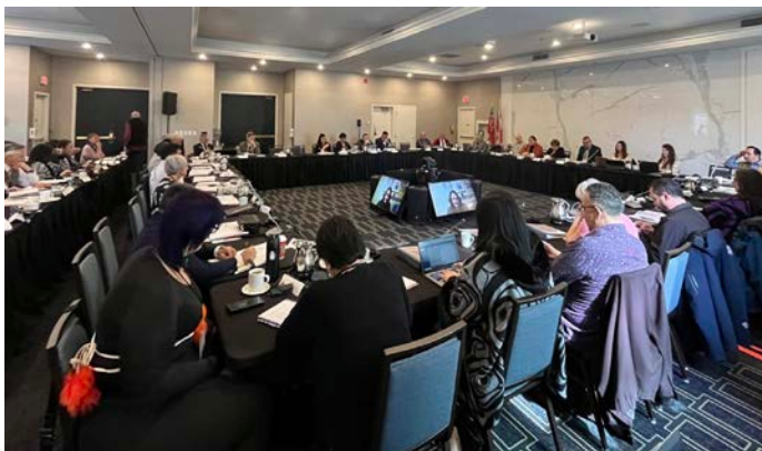
LCAC Leadership Meeting