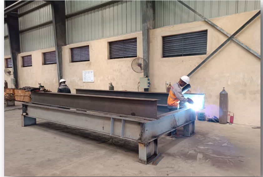
Co2 MIG welding