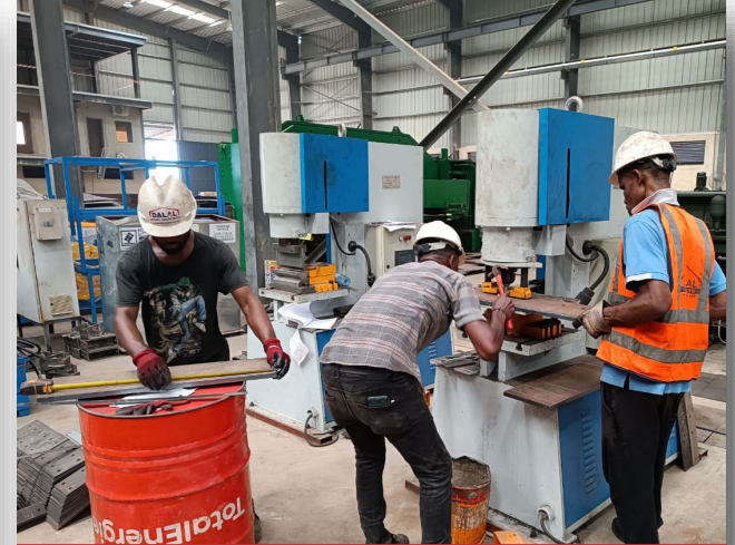
Hydraulic Punching machine

Dalal Purlins machine can make C-Purlins and Z-purlins from 80mm width and up to 300mm width 1.5mm thickness up to 3mm.