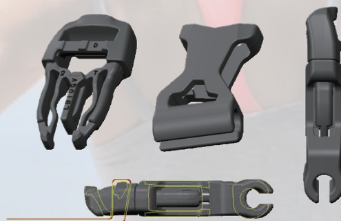
Combination buckle for "Cord & pipe"