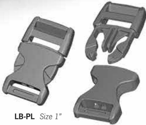
LB-PL Size 1"

Technological advances in the safety and sport industries keep YKK continuously developing new products to stay ahead of the competition. Our newest Ultra High Strength buckle, the LB25PL, features our strongest design yet.