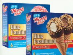
North Star "Olde Fashioned" Ice Cream Cones Select Varieties, 6 ct. box $4.99