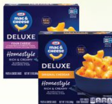
Kraft "Deluxe" Frozen Mac & Cheese Homestyle Rich & Creamy Original Cheddar or Four (4) Cheese, 12 oz. box $2.99