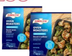
"Oven Roasters" Veggies Select Varieties, 14-15 oz. pkg.