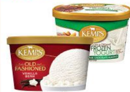
Kemps "Old Fashioned" Ice Cream or "Smooth & Creamy" Frozen Yogurt Select Varieties, 48 oz.