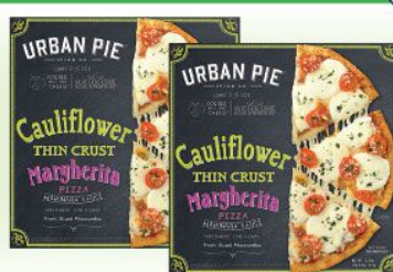
Urban Pie Cauliflower Crust Pizza Margherita, Sausage or "Special", 19.15-22 oz.