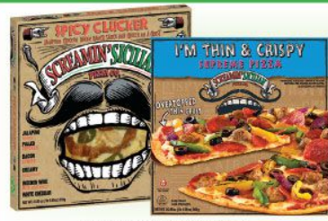
Screamin' Sicilian Pizza Original 20.8-26.9 oz. or Thin Crust 15.5-20.55 oz.