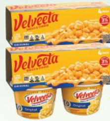
Velveeta Shells & Cheese Cups Original or 2% Milk, 4 ct. pkg. $4.49