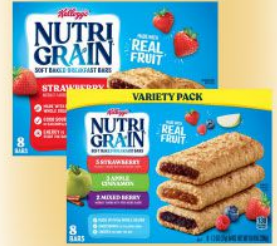
Kellogg's Nutri-Grain Bars Select Varieties, 8 ct. box 2/$6