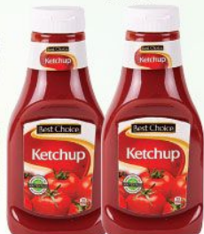
Best Choice Tomato Ketchup Original, 38 oz. btl. $1.99