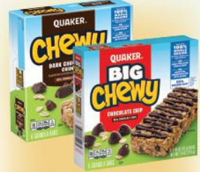
Quaker "Chewy" Bars Original, "Big" or "Dips", Select Varieties, 5-8 ct. $2.99

BUY 2 SAVE $2.00! Buy Any Two (2) Participating Products, Save $2.00! Must Buy In Multiples of Two (2)