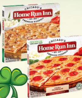
Home Run Inn 12" Ultra Thin Crust Pizza 16-21 oz. 2/$12