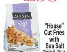
"House" Cut Fries with Sea Salt Original, 28 oz.