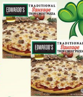
Edwardo's Thin Crust Pizza 28 oz. 2/$12