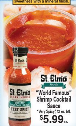
St. Elmo "World Famous" Shrimp Cocktail Sauce "Very Spicy", 12 oz. btl. $5.99 ea.