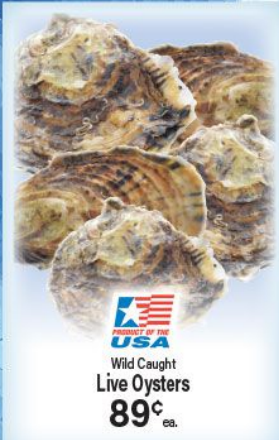
USA Wild Caught Live Oysters 89¢ ea.