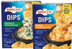
Dips Buffalo Cauliflower or Spinach & Artichoke, 10 oz. pkg.