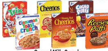
General Mills Cereals Trix 10.7 oz., Original Cheerios 8.9 oz., Cocoa Puffs 10.4 oz., Golden Grahams 11.7 oz., Cinnamon Toast Crunch 12 oz., Honey Nut Cheerios 10.8 oz. or Reese's Puffs 11.5 oz. 2/$4 Price Valid When You Buy Two (2)! Regular Sale Price 2 for $6.00

BUY 2 SAVE $2.00! Buy Any Two (2) Participating Products, Save $2.00! Must Buy In Multiples of Two (2)