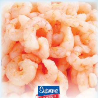
Supreme CHOICE Frozen 100-200 ct. Tail-Off Cooked Shrimp 16 oz. pkg. $6.99 ea.