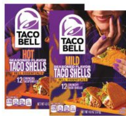
Seasoned Flavor Taco Shells Hot or "Mild", 12 ct. box $2.99