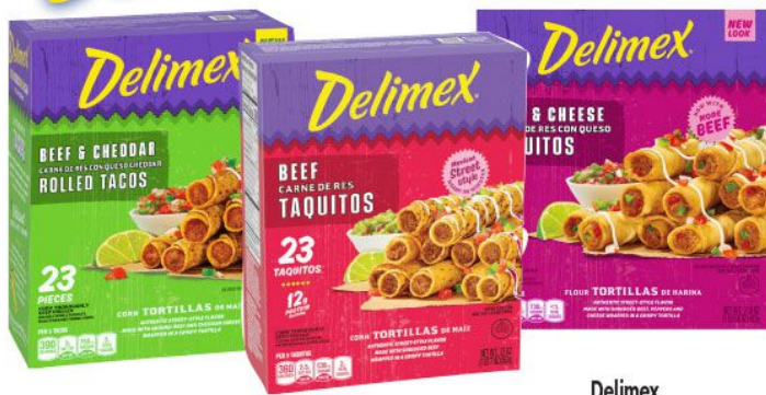
Delimex Rolled Tacos Beef & Cheddar, 23 oz. pkg.