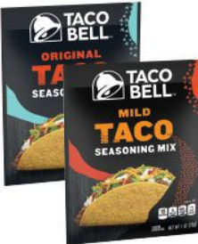
Seasoning Mixes Original Taco, "Mild" Taco or Original Fajita, 1-1.4 oz. pkg. 79¢