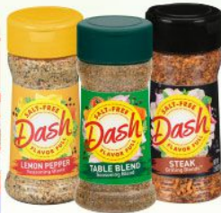
Dash Salt-Free Seasoning Blends Select Varieties, 2.4-2.6 oz. shaker $2.99