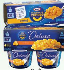
Kraft Macaroni & Cheese Cups Original, "Deluxe", Triple Cheese or "Shapes", 4 ct. pkg. $4.49