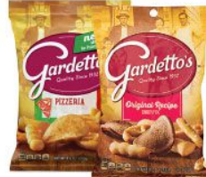
Gardetto's Snack Mix Select Varieties, 8-8.6 oz. 2/$3 Price Valid When You Buy Two (2)! Regular Sale Price 2 for $5.00