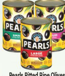
Pears Pitted Ripe Olives Small, Medium, Large or Extra Large, 6 oz. can $1.99