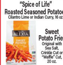
Sweet Potato Fries Original with Sea Salt, Crinkle Cut or "Waffle" Cut, 20 oz.