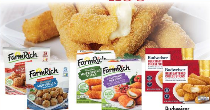
Farm Rich Flame-Broiled Meatballs Original, Italian-Style or Turkey 20-26 oz.