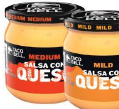
Salsa Con Queso Medium or "Mild", 15 oz. jar $3.29