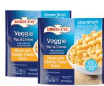
Veggie Mac & Cheese Elbows with Cheddar Cheese Sauce, 10 oz. pkg.