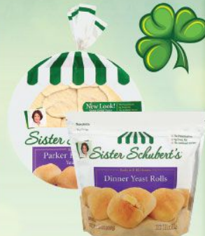
Sister Schubert's Rolls Dinner Yeast or "Parker House" Style 10 ct. pkg. $3.69