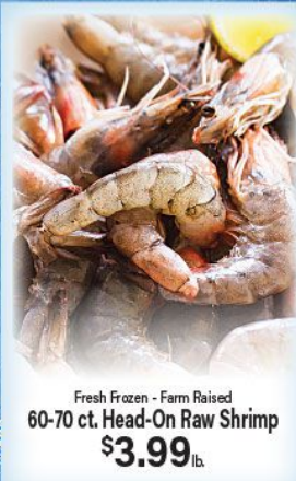
Fresh Frozen - Farm Raised 60-70 ct. Head-On Raw Shrimp $3.99 lb.