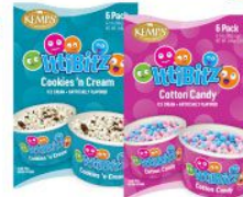
Kemps "IttiBitz" Ice Cream Cookies 'n Cream or Cotton Candy, 6 ct. pkg.