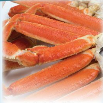
From Canada - Frozen Wild Caught Snow Crab Legs "Opilio", "5x8" $6.99 lb.