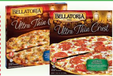
Bellatoria Ultra Thin Crust Pizza 16.03-21.71 oz.