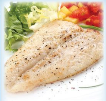
Fresh Frozen Ocean Perch Fillets $4.49 lb.

A perfect symphony of fruit, tingly acidity and subtle sweetness with a mineral finish.