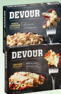
Devour Frozen Entrees Select Varieties, 9-12 oz. $2.99