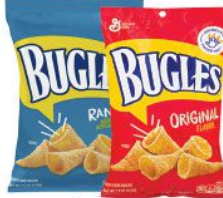
Bugles Corn Snacks Select Varieties, 7.5 oz. 2/$3 Price Valid When You Buy Two (2)! Regular Sale Price 2 for $5.00