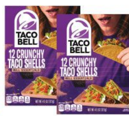
"Bell Essentials" Taco Shells "Crunchy", 12 ct. box $2.49