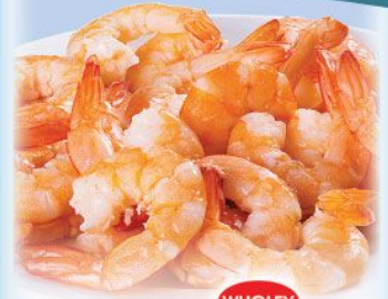
WHOLEY Frozen 41-50 ct. Tail-On Cooked Shrimp 16 oz. pkg. $6.99 ea. While Supplies Last!