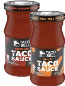
Taco Bell Taco Sauce Medium or "Mild", 8 oz. jar $1.79