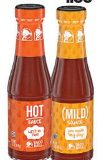
Taco Bell Sauce Hot, "Mild" or "Fire", 7.5 oz. btl. $1.79