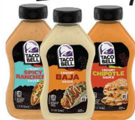
"Creamy" Sauce Chipotle, Avocado Ranch, Baja or Spicy Ranchero, 12 oz. btl. $1.79