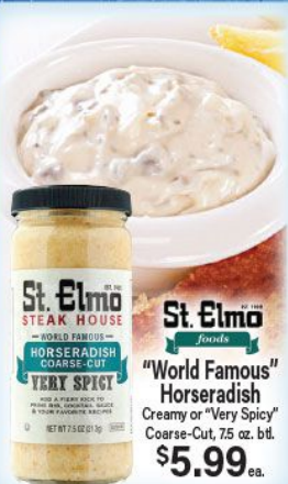
St. Elmo "World Famous" Horseradish Creamy or "Very Spicy" Coarse-Cut, 7.5 oz. btl. $5.99 ea.