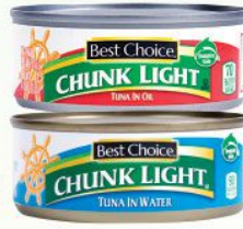
Best Choice Chunk Light Tuna In Water or Oil, 5 oz. can 79¢