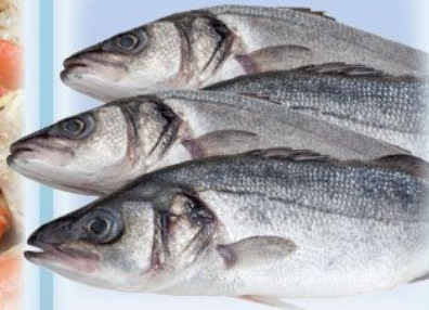
From Greece - Fresh Farm Raised Whole Mediterranean Branzini WHOLE ONLY! $6.99 lb.