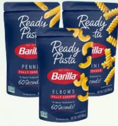
Barilla Fully-Cooked "Ready Pasta" Penne, Rotini or Elbows, 7 oz. pkg. 2/$3