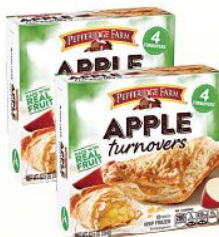
Pepperidge Farm Fruit Turnovers Apple or Peach, 12.5 oz. $3.99