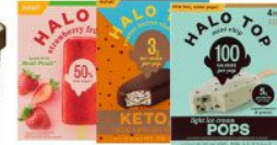
Halo Top "Fruit Pops" Bars 6-12 ct. pkg. "Pops" Bars Keto or Light Ice Cream, 4 ct. pkg. or Yogurt Bars 4 ct. pkg. Select Varieties