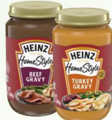
Heinz Original "Homestyle" Gravy Select Varieties, 12 oz. jar $2.49