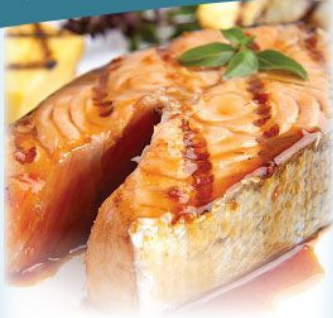
From Canada - Fresh Farm Raised Atlantic Salmon Steaks $7.99 lb.