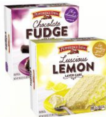
Pepperidge Farm Layer Cakes Select Varieties, 19.6 oz. $3.99