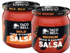
"Thick N' Chunky" Salsa Medium or "Mild", 16 oz. jar $2.79