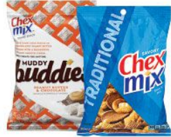
Chex Mix Snack Mix Select Varieties, 7-8.75 oz. 2/$3 Price Valid When You Buy Two (2)! Regular Sale Price 2 for $5.00