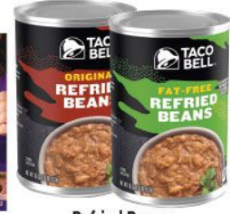
Refried Beans Original or Fat-Free, 16 oz. can $1.59