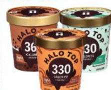
Halo Top Ice Cream Light Ice Cream or "Keto Series" Frozen Dessert, Select Varieties, 1 pint