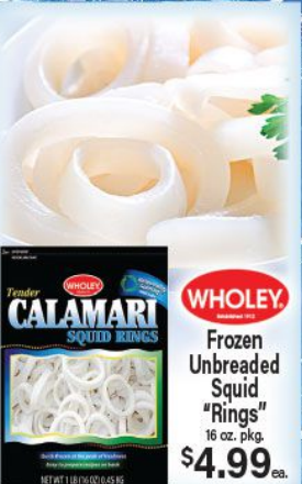
WHOLEY Frozen Unbreaded Squid "Rings" 16 oz. pkg. $4.99 ea.

A perfect symphony of fruit, tingly acidity and subtle sweetness with a mineral finish.