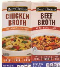
Best Choice Broth Beef, Chicken or Vegetable, Select Varieties, 32 oz. box $1.89