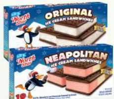
North Star Ice Cream Sandwiches Original or Neapolitan, 12 ct. or "Mini" Original, 16 ct. $4.99