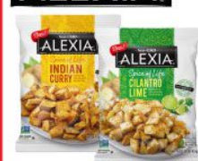
"Spice of Life" Roasted Seasoned Potatoes Cilantro Lime or Indian Curry, 16 oz.