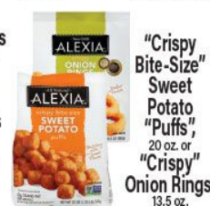
"Crispy" Bite-Size Sweet Potato "Puffs", 20 oz. or "Crispy" Onion Rings, 13.5 oz.