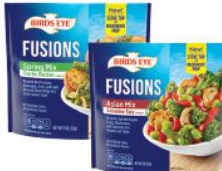
"Fusions" Veggies "Asian" Mix or "Spring" Mix, 11 oz. pkg.