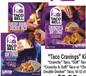
"Taco Cravings" Kit "Crunchy" Taco, "Soft" Taco, "Crunchy & Soft" Taco or "Cheesy Double Decker" Taco, 10-12 ct. box $2.99