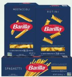
Barilla Pasta Select Cuts, 12-16 oz. 2/$3