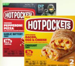
Hot Pockets Select Varieties, 9 oz. pkg. 5/$10