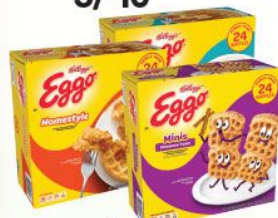
Eggo "Family Pack" Waffles "Homestyle", Buttermilk, Blueberry, Chocolate Chip or "Minis" Cinnamon Toast, 24 ct. pkg. $5.99