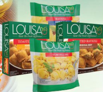
Louisa Ravioli or Tortellini Select Varieties, 16-22 oz. $4.49