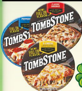
Tombstone Original Pizza 17.2-21.3 oz. 2/$8