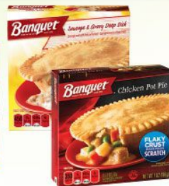
Banquet Pot Pies Original or "Deep Dish", Select Varieties, 7 oz. 99¢