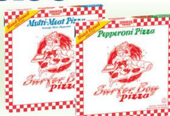
Surfer Boy Pizza 21.3-25.2 oz.