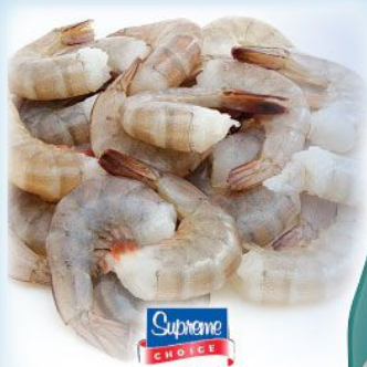
Supreme CHOICE Frozen 16-20 ct. "E-Z" Peel Raw Shrimp 16 oz. pkg. $5.99 ea.