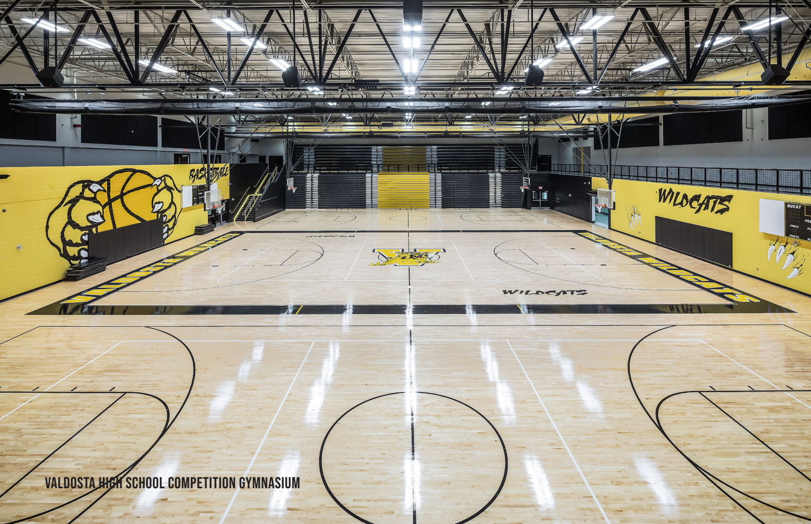
VALDOSTA HIGH SCHOOL COMPETITION GYMNASIUM