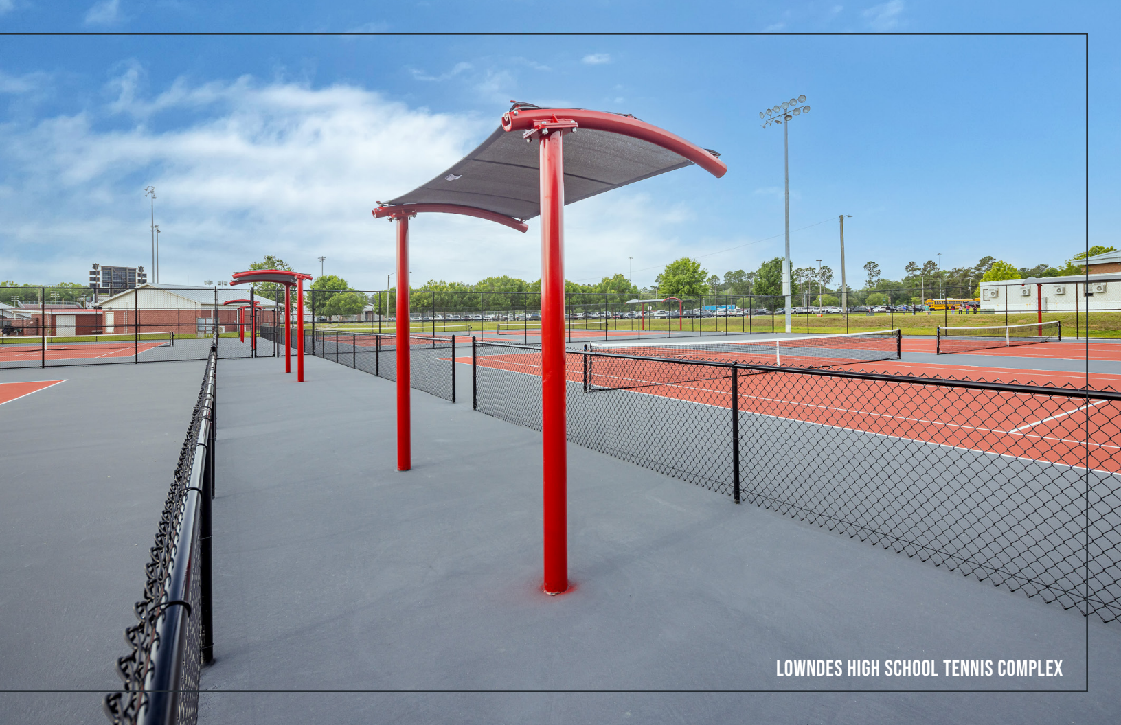
LOWNDES HIGH SCHOOL TENNIS COMPLEX