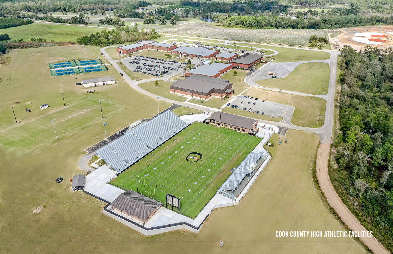
COOK COUNTY HIGH ATHLETIC FACILITIES