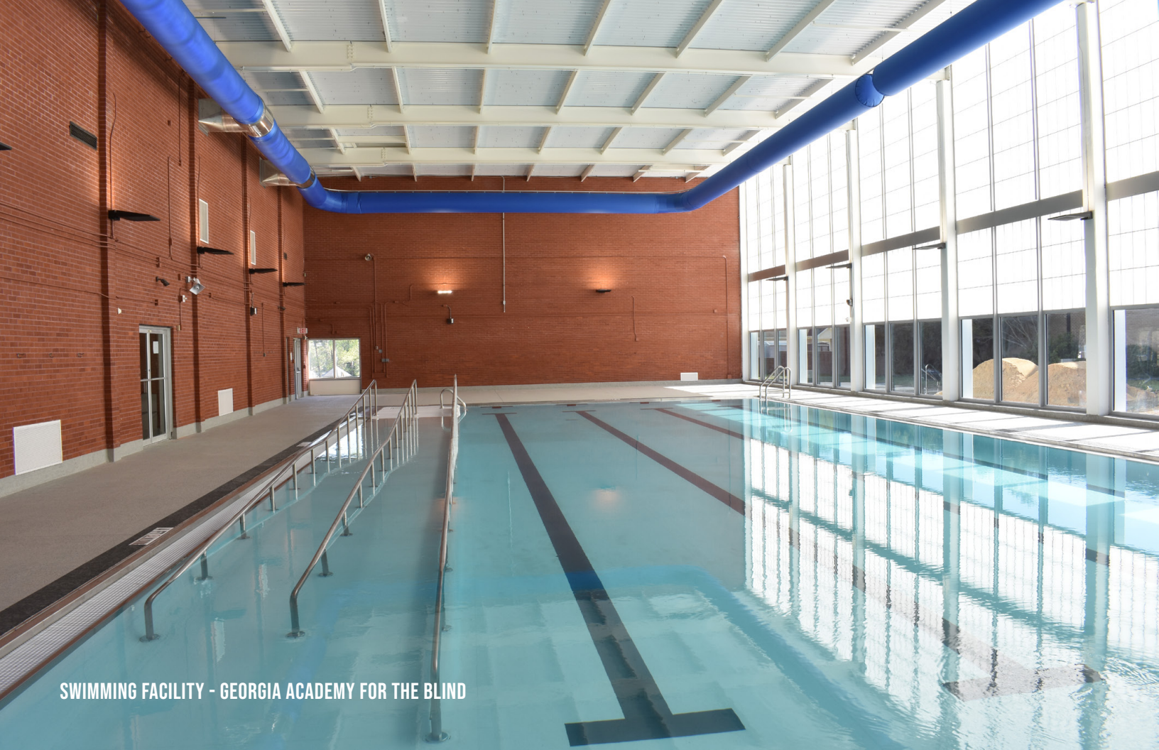
SWIMMING FACILITY - GEORGIA ACADEMY FOR THE BLIND