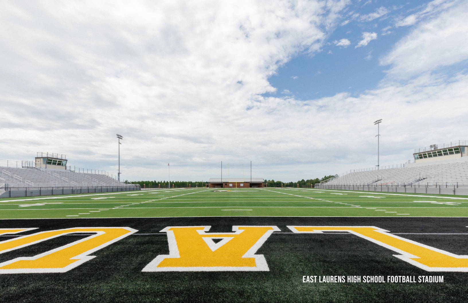
EAST LAURENS HIGH SCHOOL FOOTBALL STADIUM