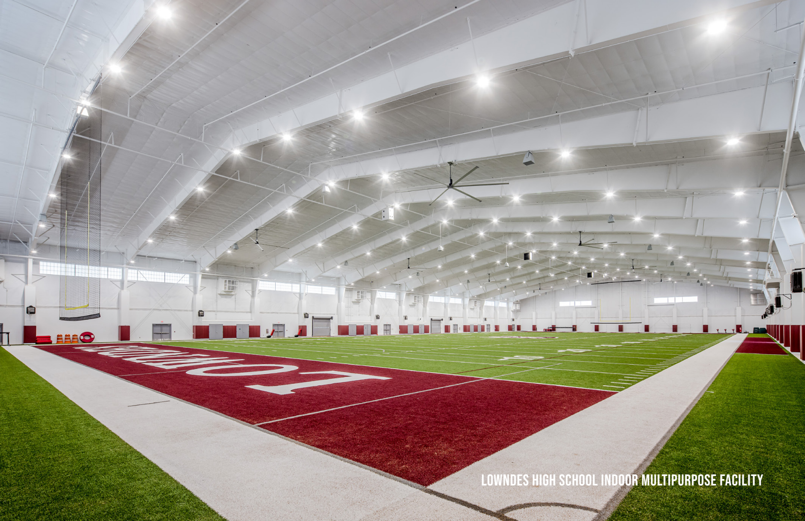
LOWNDES HIGH SCHOOL INDOOR MULTIPURPOSE FACILITY