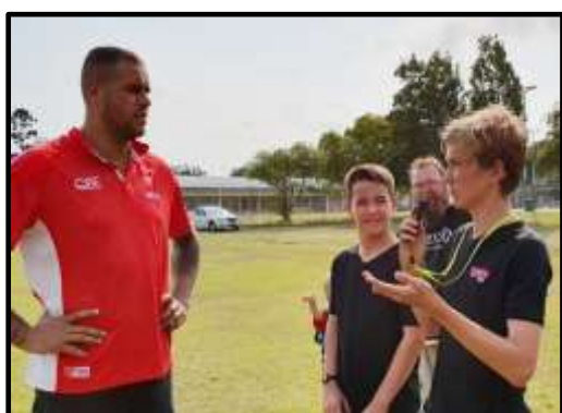
Will and Asher (The Sound Surfers) with Sydney Swan, Lance 'Buddy' Franklin

17x 30 sec spots x Zone 1 + 41 x 30 sec spots x Zone 2 $1,620.00 Bonus 12 x 30-sec spots Zone 2