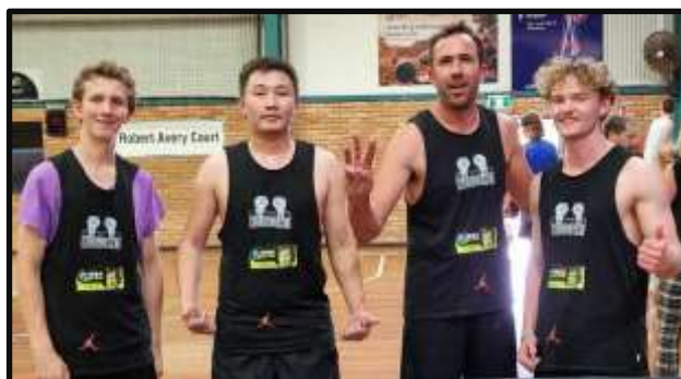
The 104.1 CHY FM Knuckleheads competing at the 3x3 Hustle Ball For Domestic Violence.