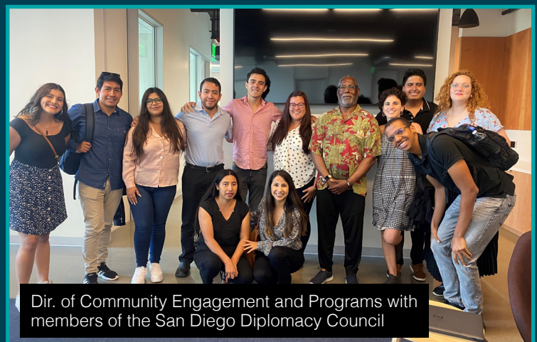
Dir. of Community Engagement and Programs with members of the San Diego Diplomacy Council