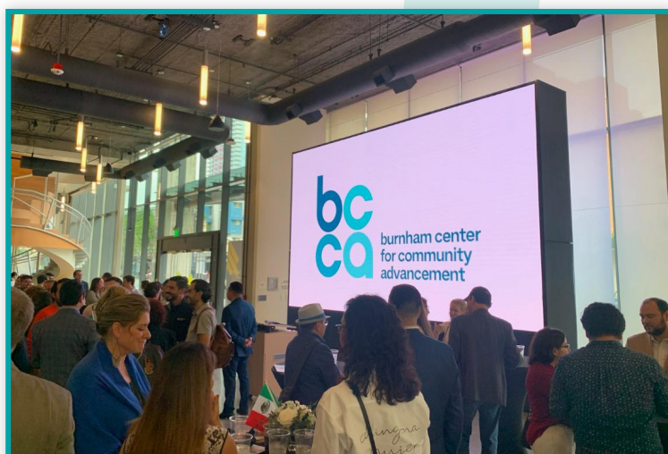
Pictured above, BCCA celebrates Mexico's 212th Independence Day with partners, and hosts the Mexican delegation to the 2022 Biocom Convention, at UC San Diego Park & Market.