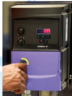
Controller supplied. VFD in a NEMA 4X enclosure.

The DEFINER features a variable frequency drive (VFD) provided in a Nema 4X enclosure. With the VFD, you can precisely adjust the unit rotational speed, influencing the particle size and throughput rate.