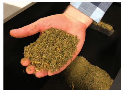
The DEFINER DF2000 processes hemp with uniform particle size distribution and minimal heat generation.

Dimensions are subject to change. Contact the factory for a certified drawing. Contact Franklin Miller to set up a test of your material in our customer test center.