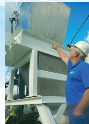
A DELUMPER Triple LP supplied as part of a complete system.