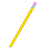
a pencil with an intact eraser