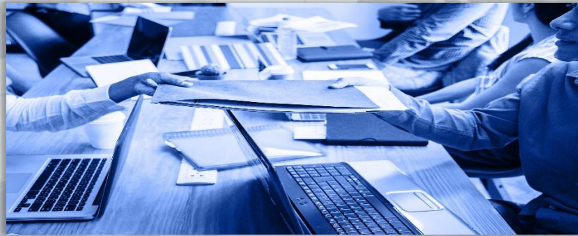
Chart of accounts

Journal entries with proper supporting documents