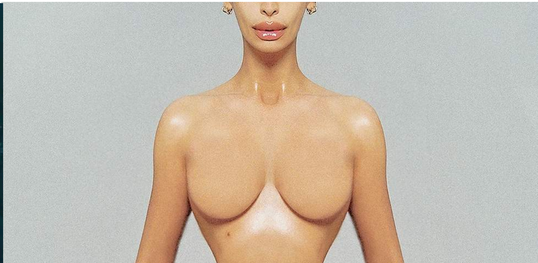
Raving Dahlia EP - 2022