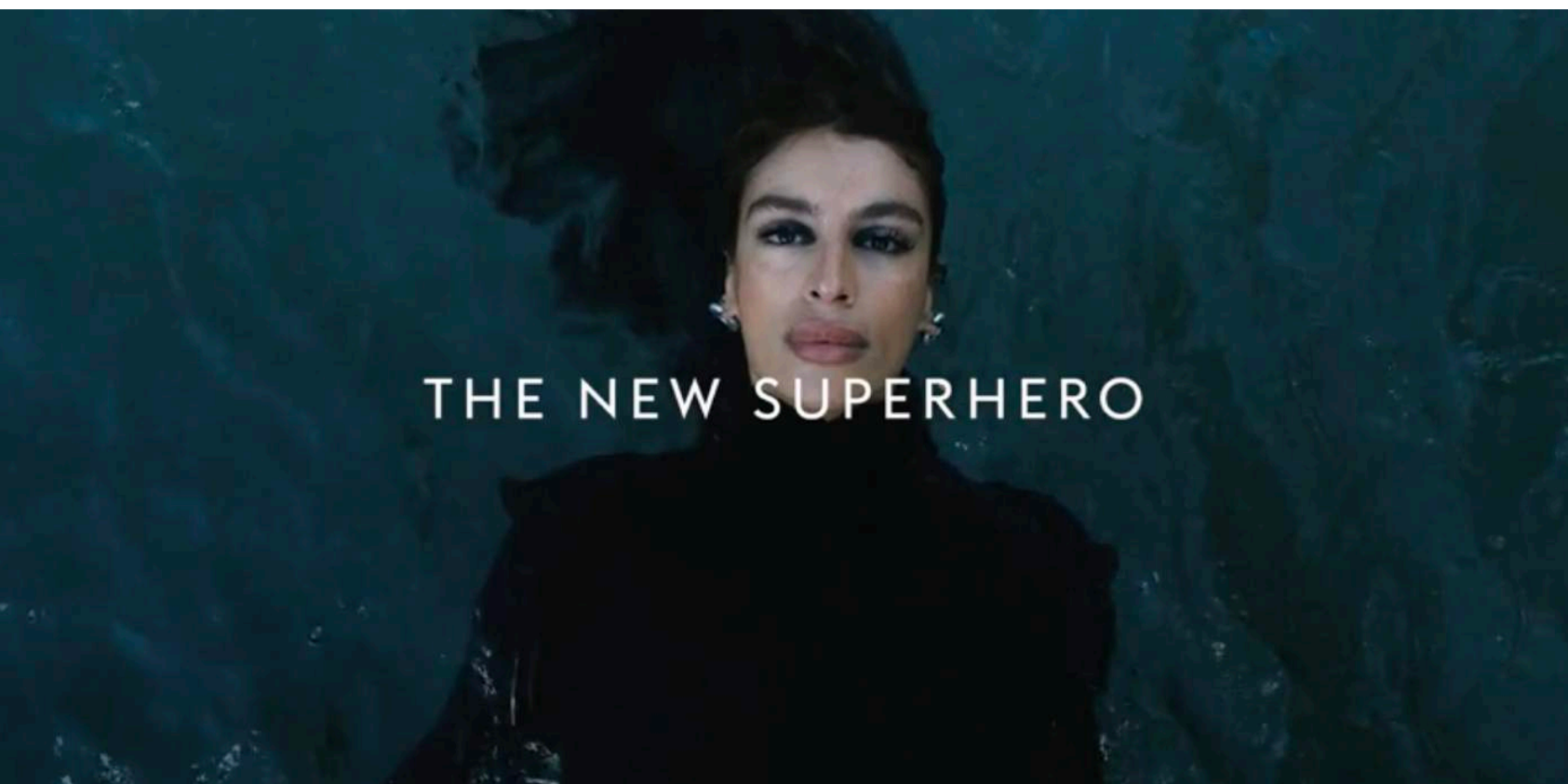
Ray-Ban Studios Campaign - 2022