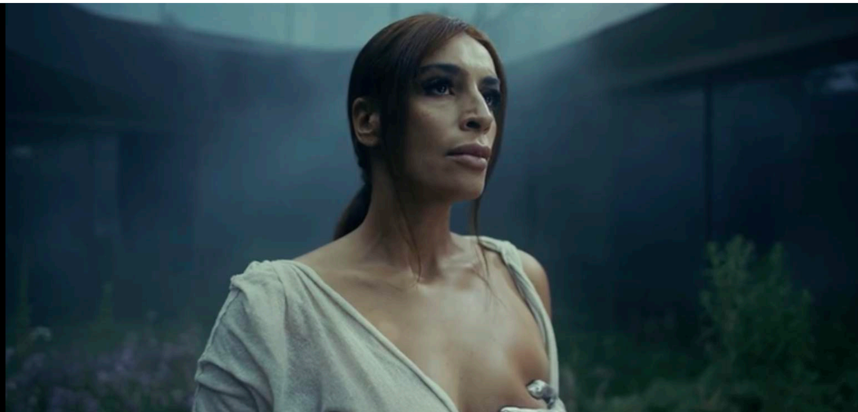
Homunculus Film - 2021