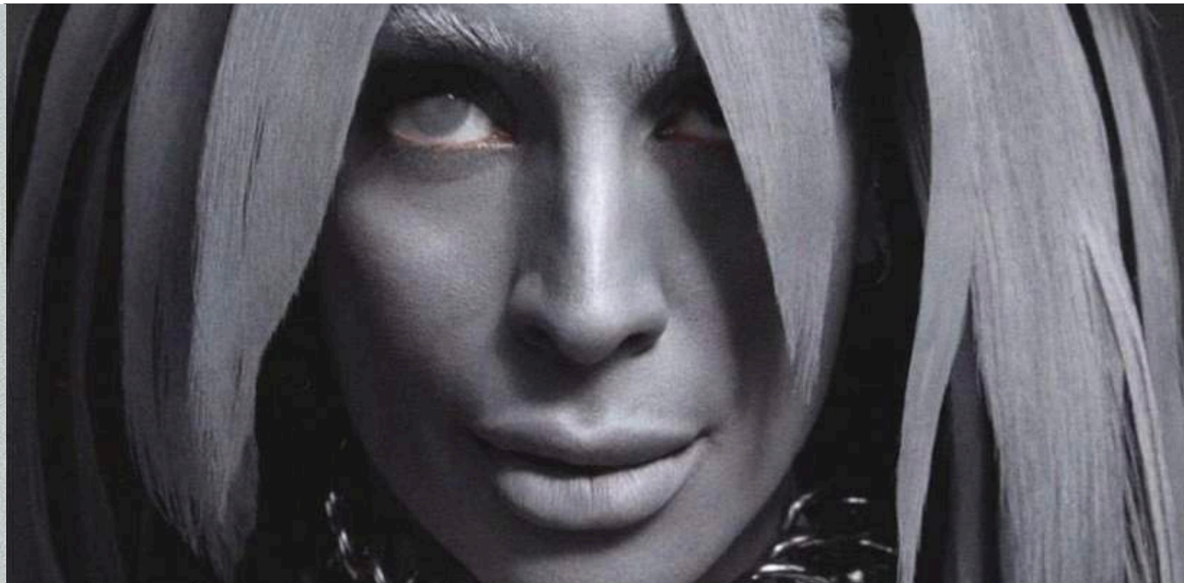
METAL Magazine Cover Story - 2022