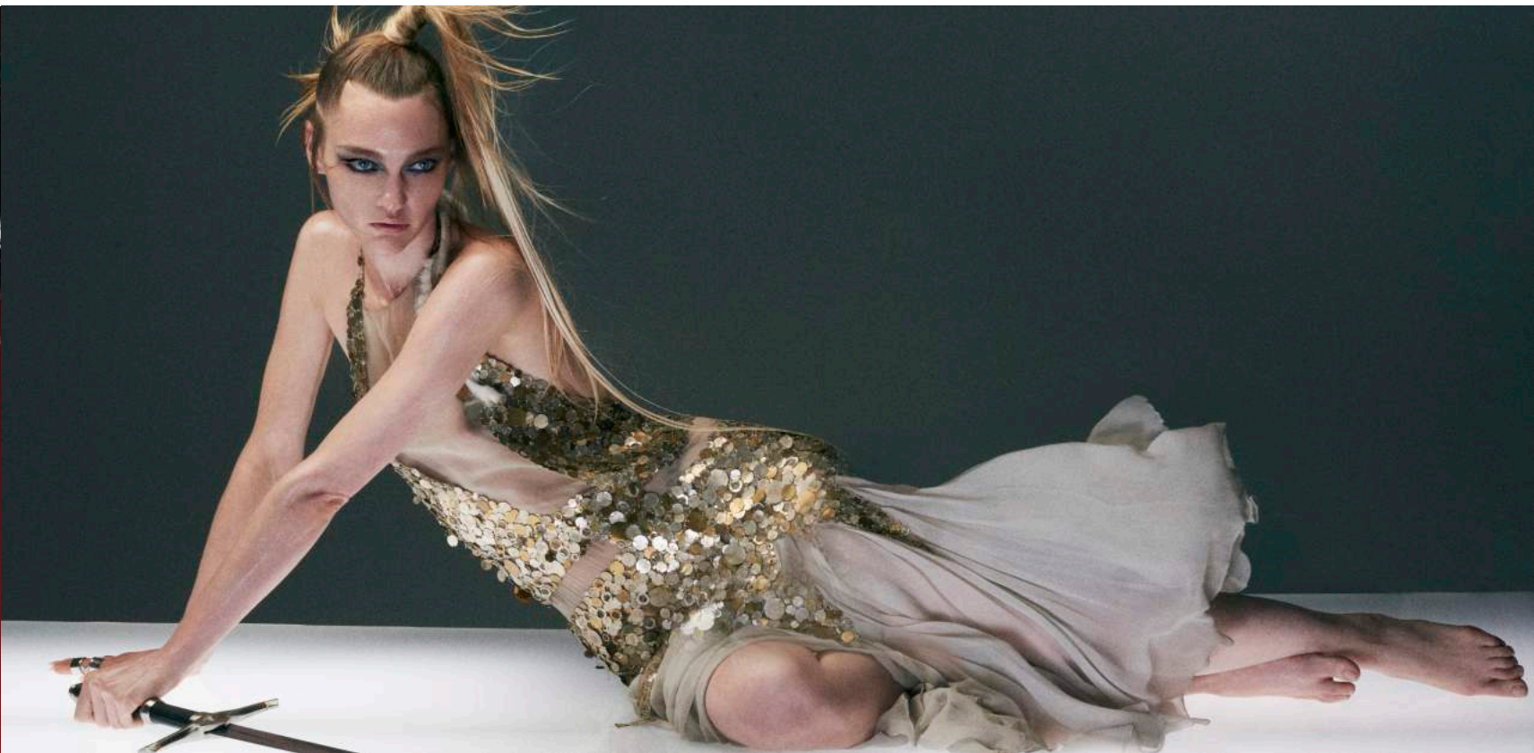
Shoot for Paradigm Trilogy Cover - 2021