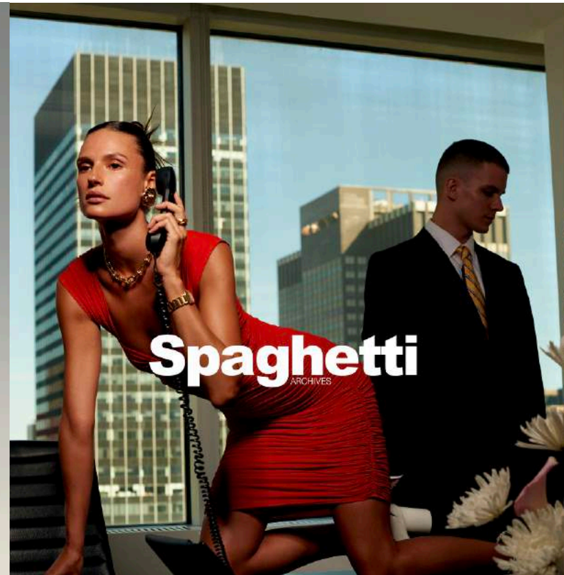
Shoot for Spaghetti Archives Editorial - 2021