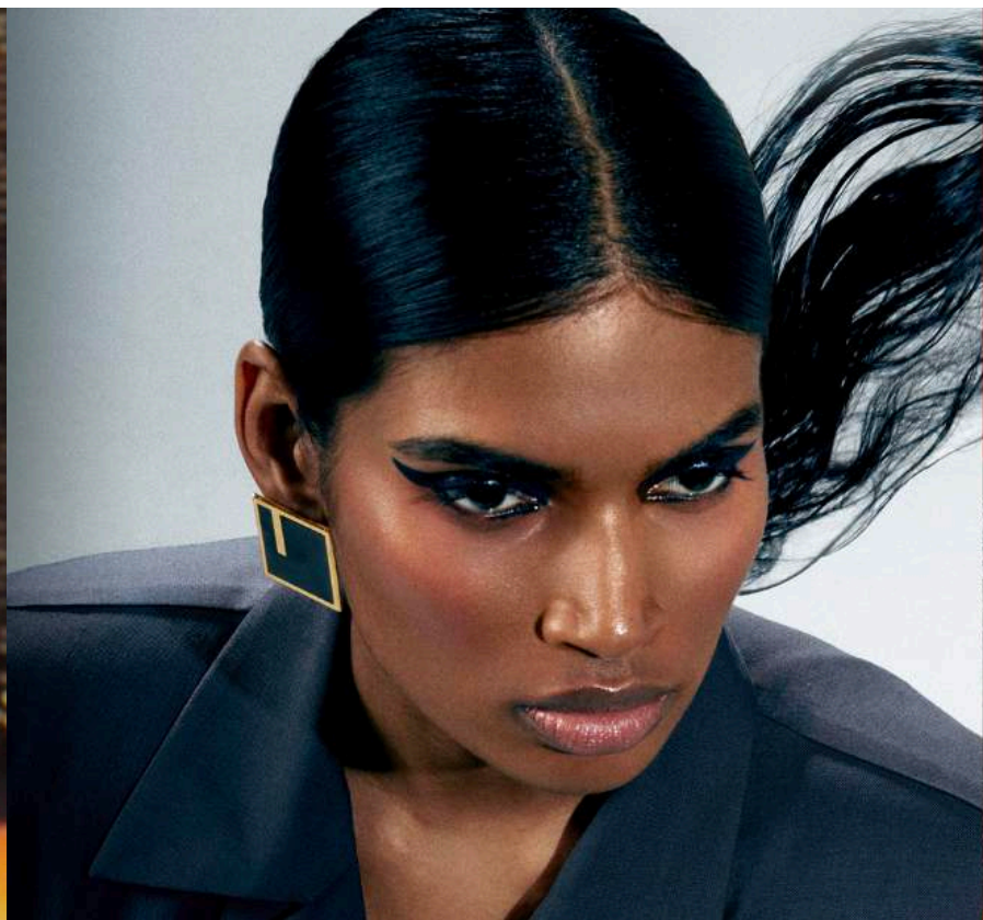
Shoot for Commision Campaign - 2021