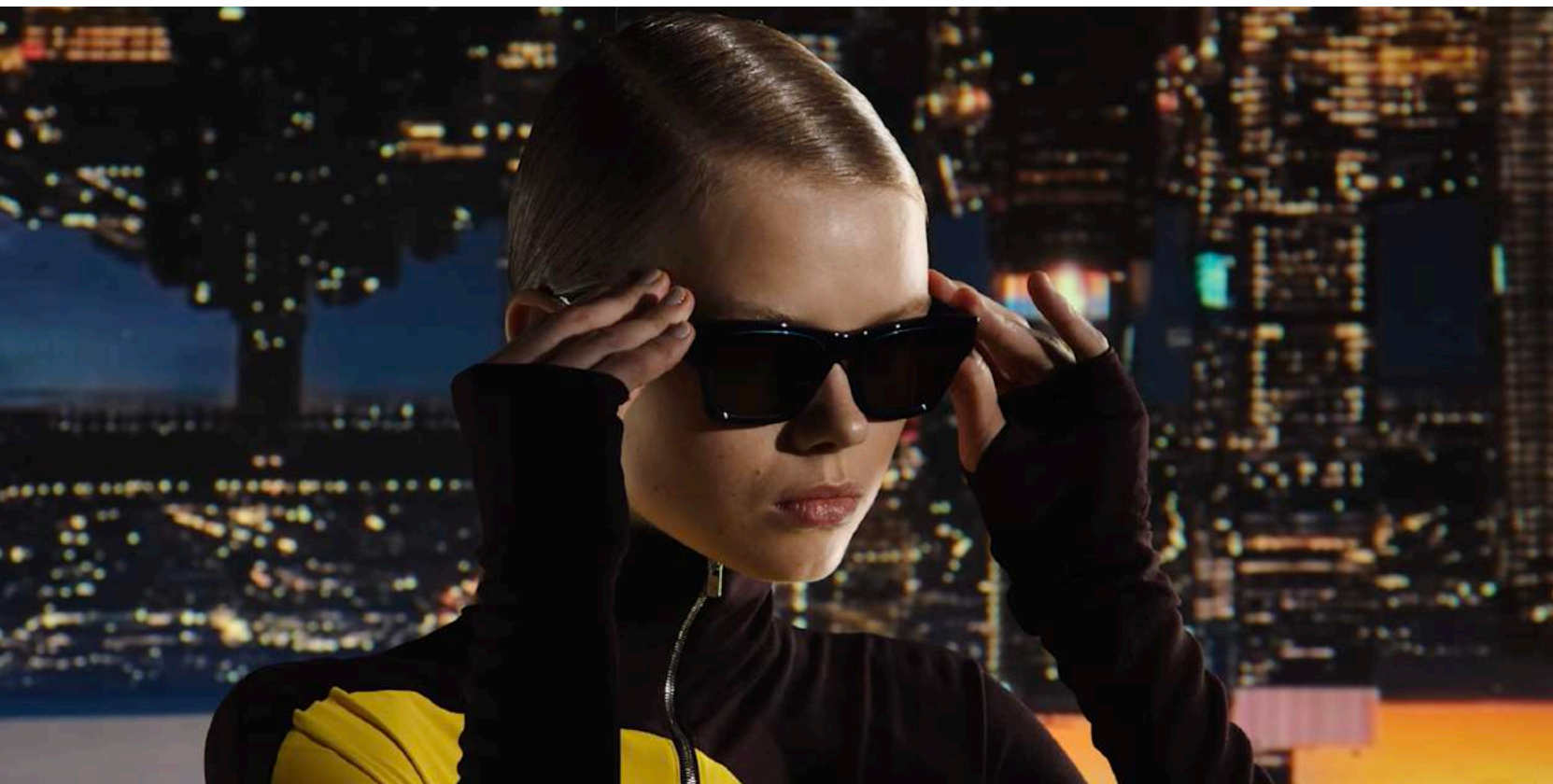
Shoot for Tory Burch Campaign - 2022