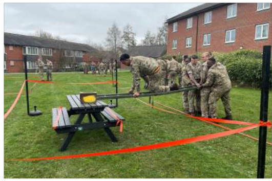
X Coy JNCOs and fusiliers demonstrate their minefield crossing capabilities

continually improve not just ourselves but also each other to uphold the Regiment's outstanding reputation.