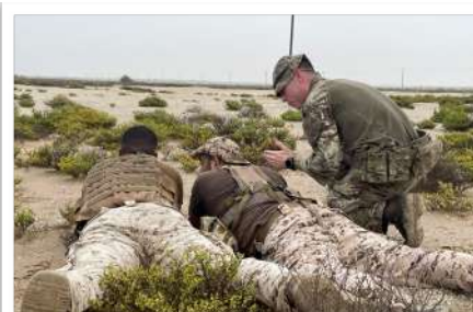
Cpl Aberdeen mentors a student section commander – employing the powerful "Brecon Point" in the process...