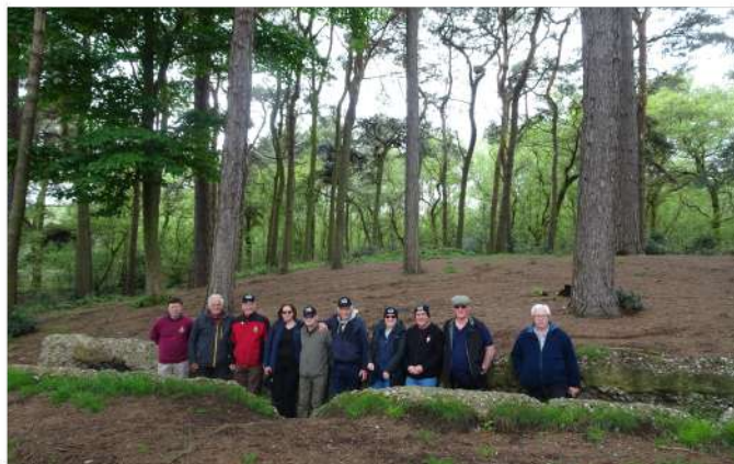
At the 1st Warwickshire Volunteer butts of 1893

On Saturday 13 May the Fusilier Association (Warwickshire) completed their first Fusilier Connect Walk and Talk in Sutton Park, Sutton Coldfield. This gave us the opportunity to see where the Birmingham Pals trained in 1914 before they set off for France. Sadly 2,334