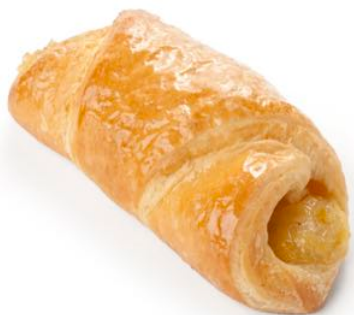
APPLE & CUSTARD LARGE DANISH Frozen shelf life - 6 months