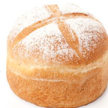
REWANA Frozen shelf life - 6 months