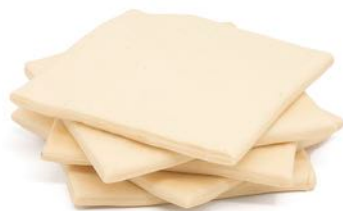
DANISH PASTRY SQUARES Frozen shelf life - 6 months