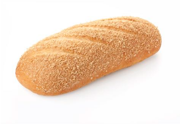
MULTI GRAIN VIENNA Frozen shelf life - 6 months