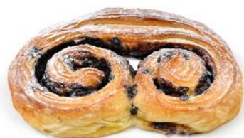
CHOCOLATE SNAIL (GILLES) Frozen shelf life - 6 months