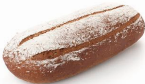
GERMAN RYE Frozen shelf life - 6 months