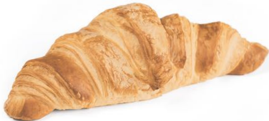
STRAIGHT CROISSANT - 95G Frozen shelf life - 6 months