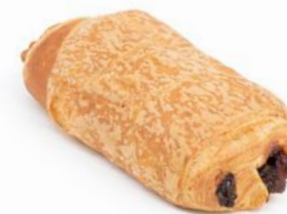
MINI PAIN AU CHOCOLAT Frozen shelf life - 6 months