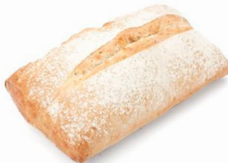
PETIT BAGUETTE Frozen shelf life - 6 months