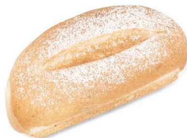
EUROPEAN ROLL Frozen shelf life - 6 months