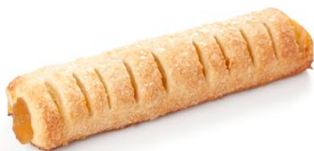
APRICOT FRUIT STICK Frozen shelf life - 6 months