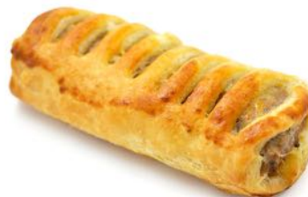
SAUSAGE ROLL (GILLES) Frozen shelf life - 6 months