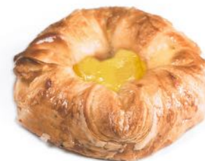
PRE PROVED APPLE & CUSTARD DANISH Frozen shelf life - 6 months