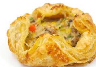
VEGETABLE DELIGHT (GILLES) Frozen shelf life - 6 months