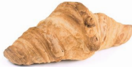
STRAIGHT CROISSANT - 50G Frozen shelf life - 6 months