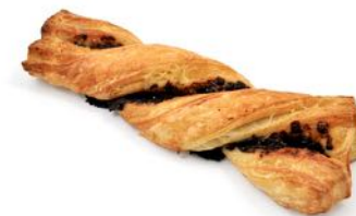
CHOCOLATE TWIST (GILLES) Frozen shelf life - 6 months