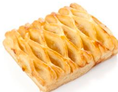
APRICOT & CUSTARD LATTICE DANISH (GILLES) Frozen shelf life - 6 months