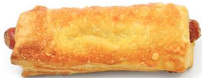
FRANKFURTER (GILLES) Frozen shelf life - 6 months