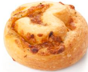
CHEESE ONION SCROLL (GILLES) Frozen shelf life - 6 months