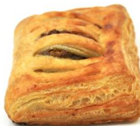
BEEF BOURGOGNE DELIGHT (GILLES) Frozen shelf life - 6 months