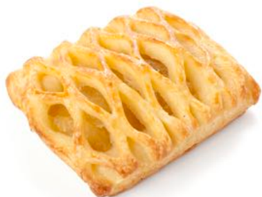
APPLE & CUSTARD LATTICE DANISH (GILLES) Frozen shelf life - 6 months