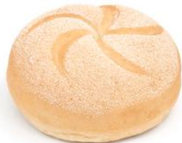
KAISER ROLLS Frozen shelf life - 6 months