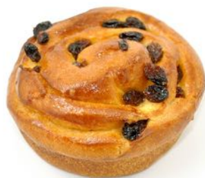
RAISIN BRIOCHE (GILLES)