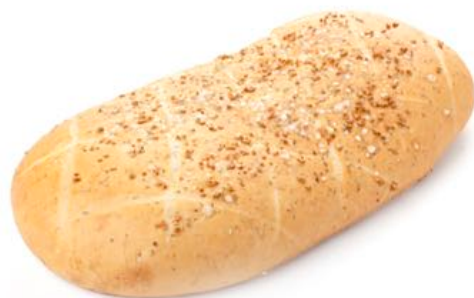
HERB & GARLIC FOCCACIA Frozen shelf life - 6 months