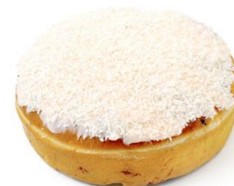
BOSTON BUN (GILLES) Frozen shelf life - 6 months