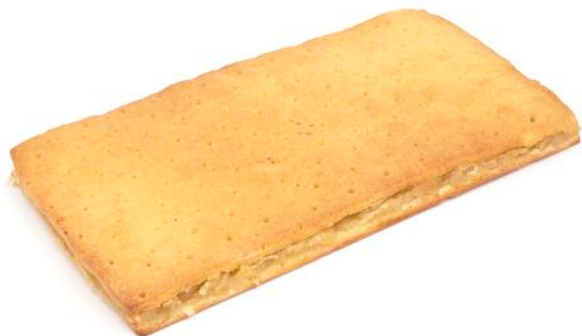
APPLE SLICE (GILLES) Frozen shelf life - 6 months