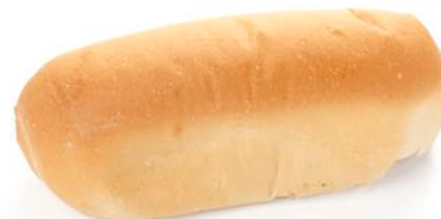
SWEET LONG ROLLS Frozen shelf life - 6 months