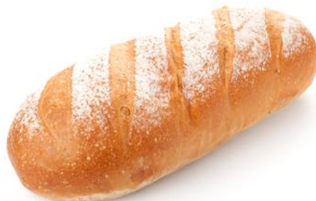
EUROPEAN ITALIAN LOAF Frozen shelf life - 6 months