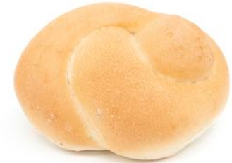
WHITE KNOT ROLLS Frozen shelf life - 6 months