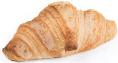
STRAIGHT CROISSANT - 30G Frozen shelf life - 6 months