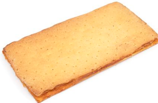
APRICOT SLICE (GILLES) Frozen shelf life - 6 months