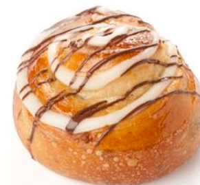
CHELSEA BUNS Frozen shelf life - 6 months