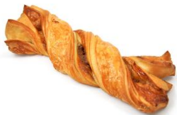
CINNAMON TWIST (GILLES)