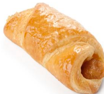
APRICOT & CUSTARD LARGE DANISH Frozen shelf life - 6 months