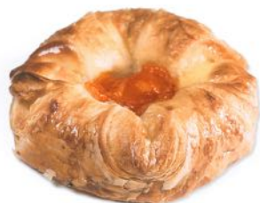
PRE PROVED APRICOT & CUSTARD DANISH Frozen shelf life - 6 months