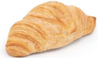
STRAIGHT CROSSAINT - 60G Frozen shelf life - 6 months