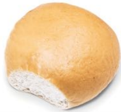
SLIDER BUNS Frozen shelf life - 6 months