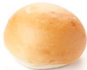
TOM THUMB WHITE ROLLS Frozen shelf life - 6 months