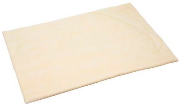
DANISH PASTRY SHEET Frozen shelf life - 6 months