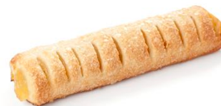
APPLE FRUIT STICK Frozen shelf life - 6 months