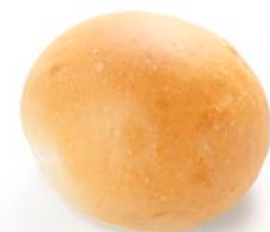
SWEET ROUND ROLLS Frozen shelf life - 6 months