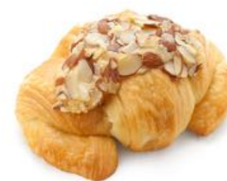
ALMOND CROISSANT (GILLES)