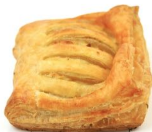
CHICKEN BECHAMEL DELIGHT (GILLES) Frozen shelf life - 6 months