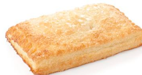
APPLE TURNOVER Frozen shelf life - 6 months