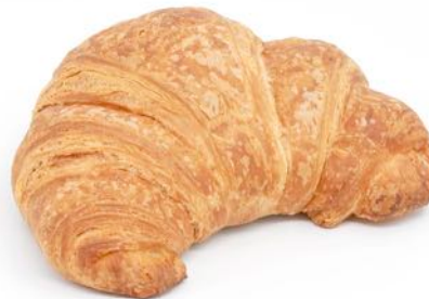
CURLED CROISSANT - 95G Frozen shelf life - 6 months