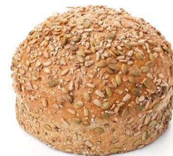
FARMHOUSE COBB (GILLES) Frozen shelf life - 6 months