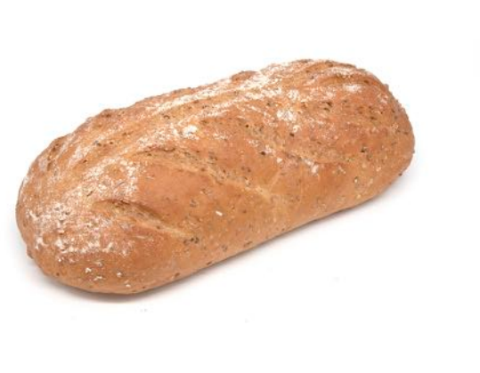
LIGHT GERMAN RYE Frozen shelf life - 6 months