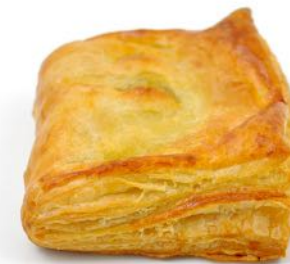
LAMB & MINT DELIGHT (GILLES) Frozen shelf life - 6 months