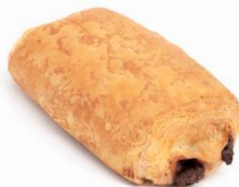
PAIN AU CHOCOLAT Frozen shelf life - 6 months