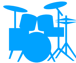
Full drum kit