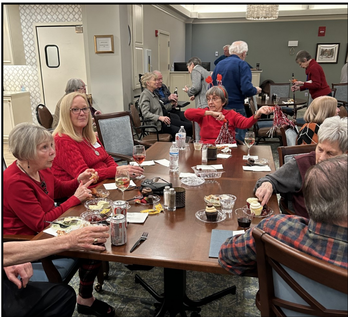
Super Bowl Sunday