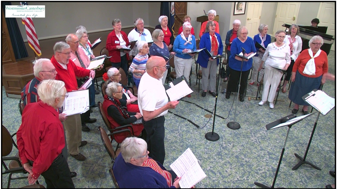
The Return of the Westbury Choristers