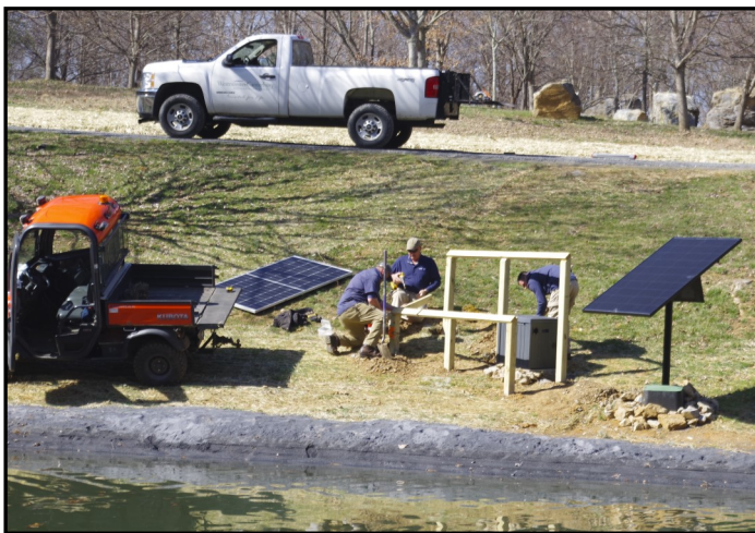
Installing solar panels to provide power for a fountain in Goff Pond.