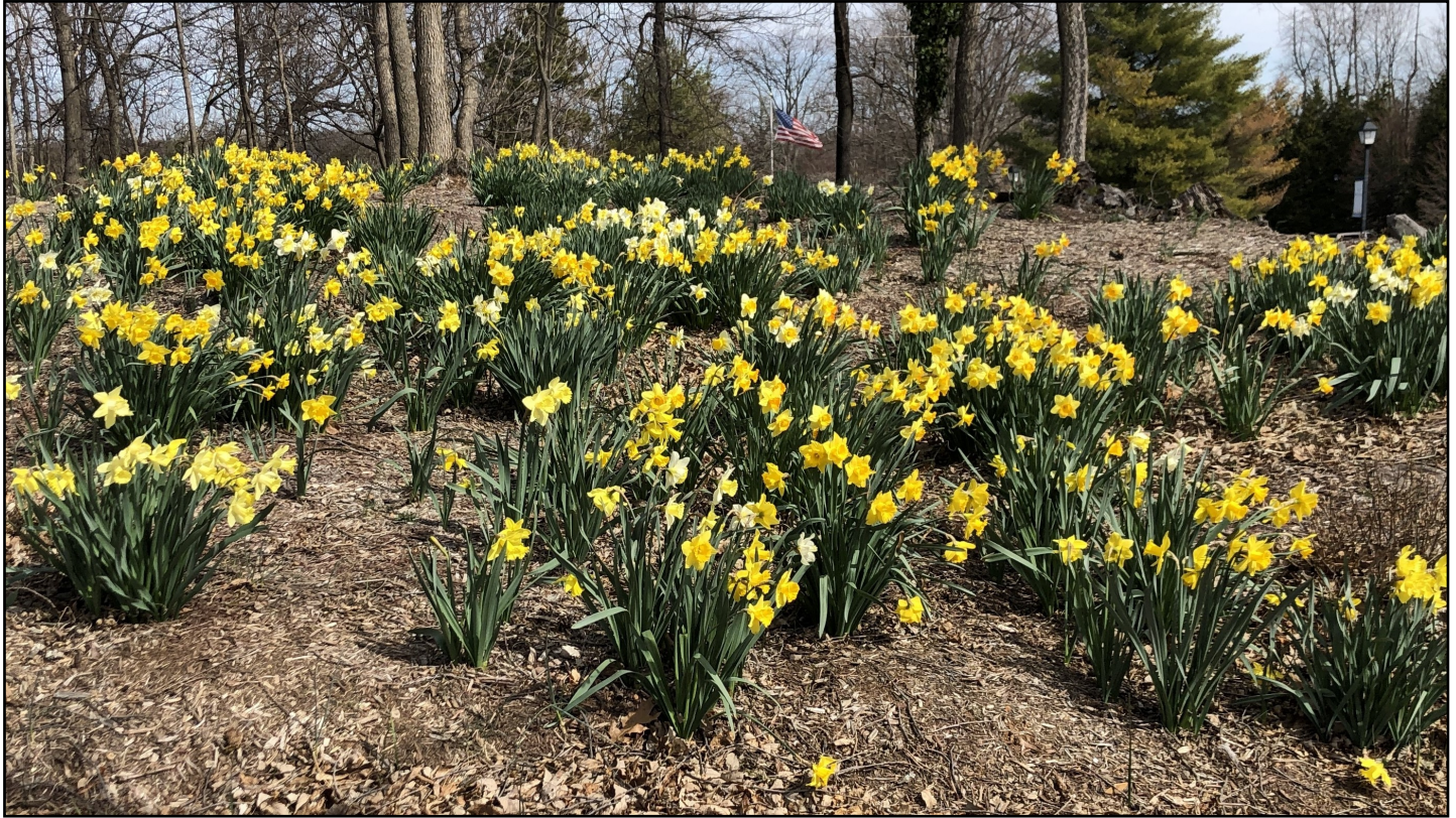
A Delight of Daffodils