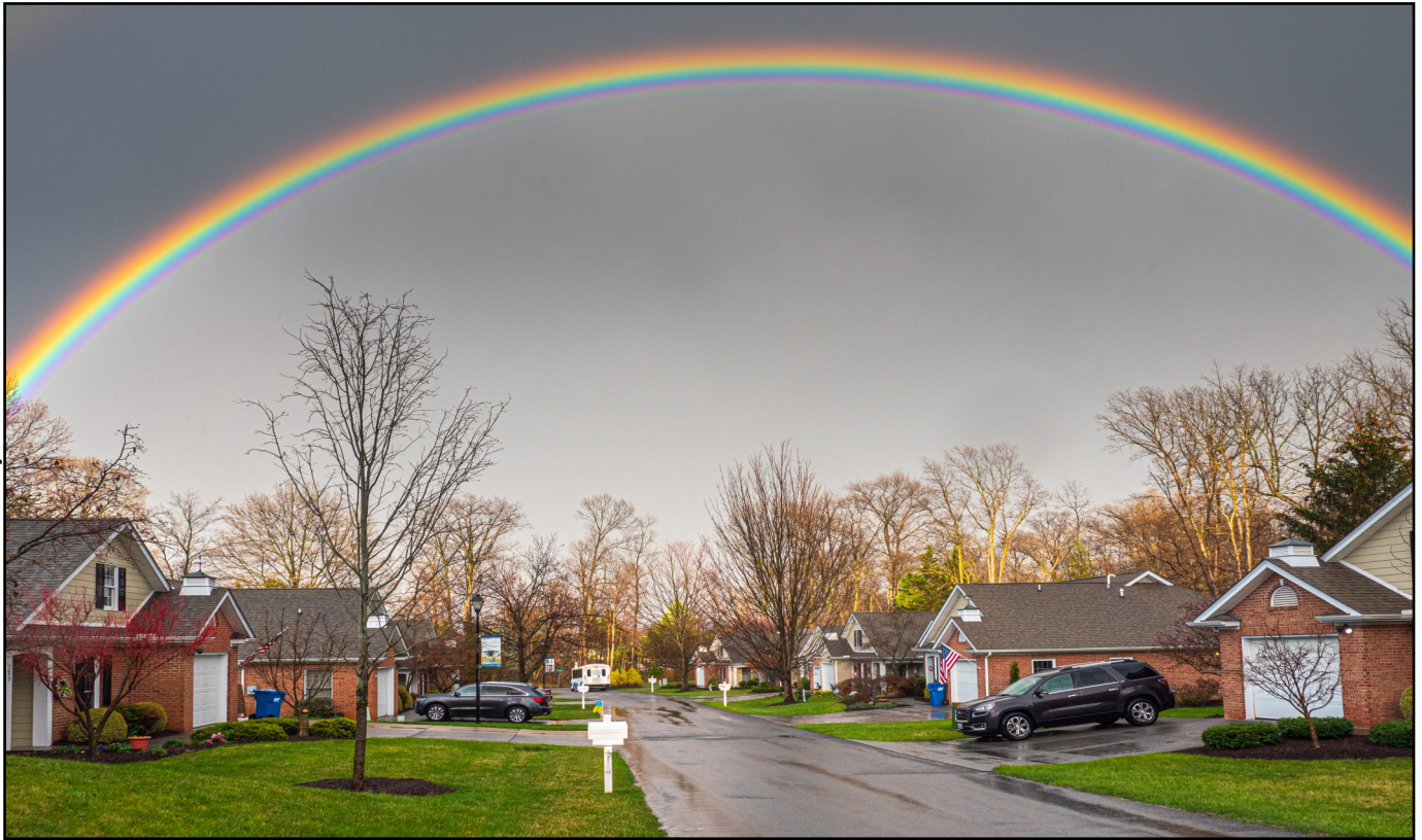
After the Storm