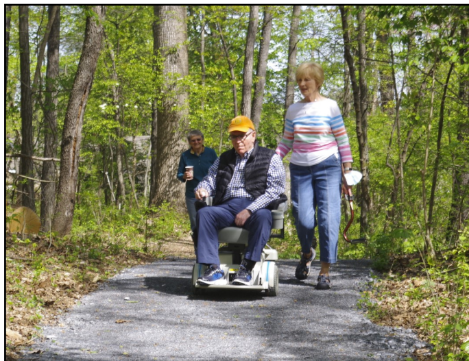
The Sinclairs test Moore Trail