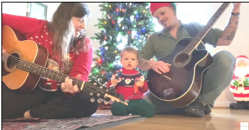
D'Arcangelis family performs "Jingle Bells" for the Variety Show