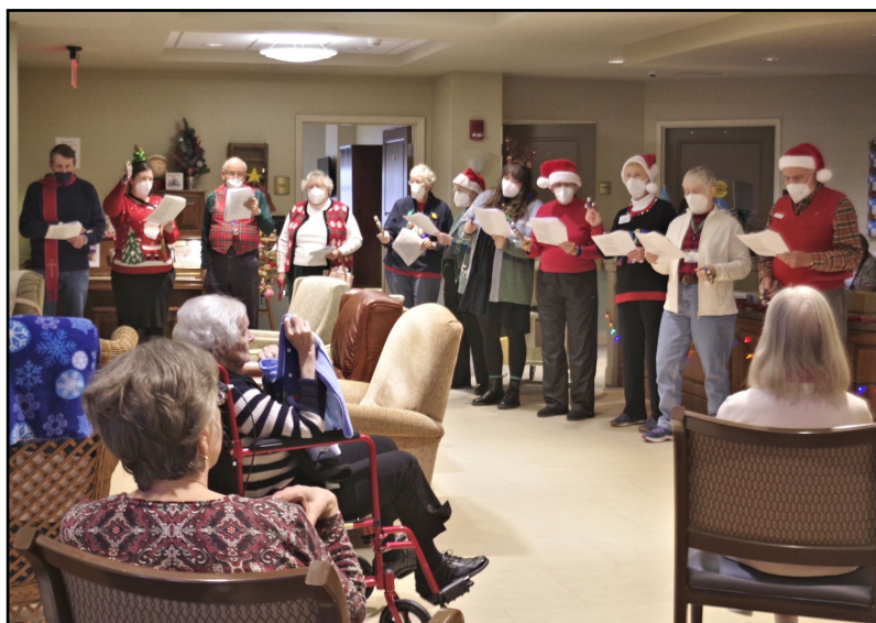
Christmas Carolers at Blue Ridge Hall