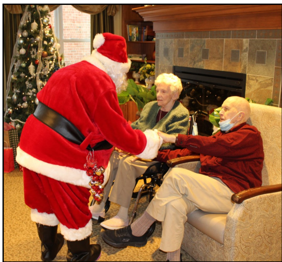
Santa Arrives in Health Care