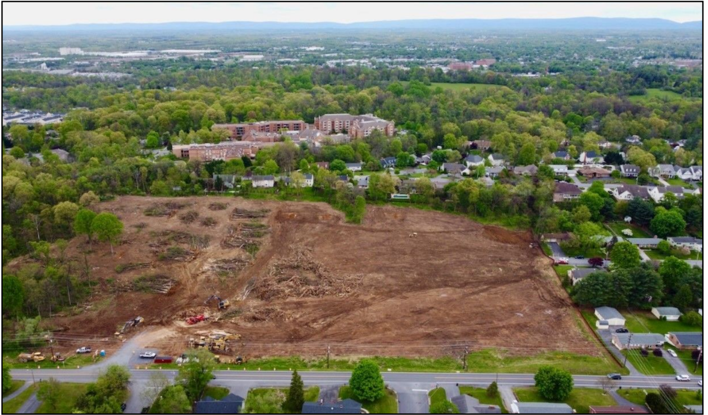
Clearing the way for the Villas