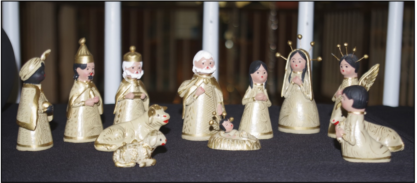
A Christmas Crèche on Display in the Commons