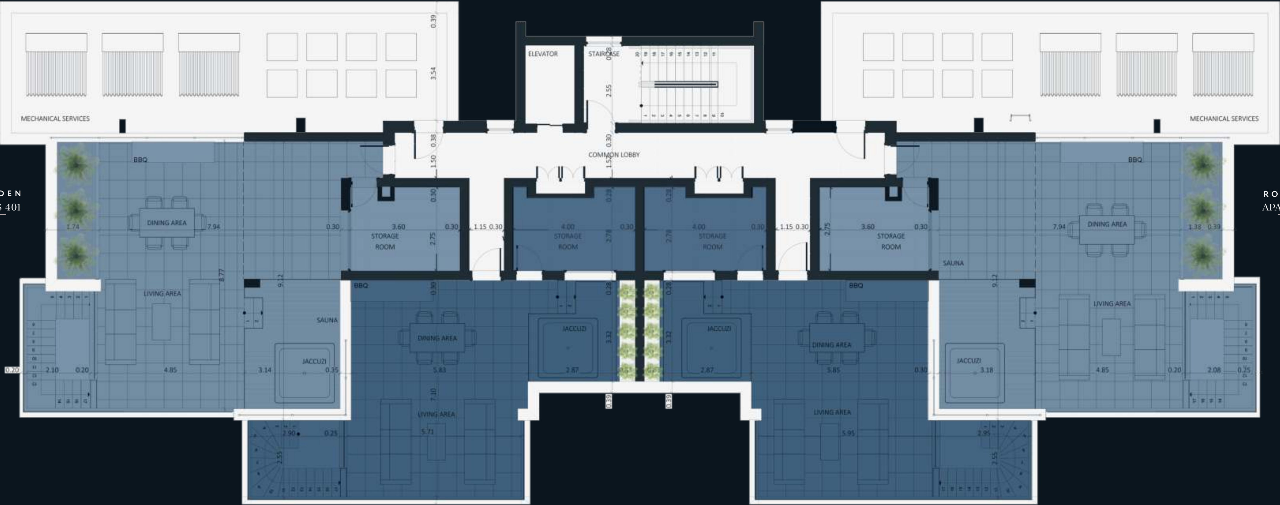
ROOF GARDEN APARTMENTS 404 92,0 M²