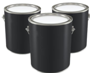
Touch-up Repair Stains