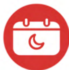
15 Ramadan 2022