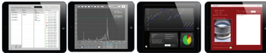
View Plant Status