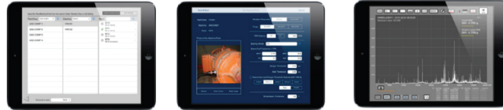
Create, Edit and Manage Routes