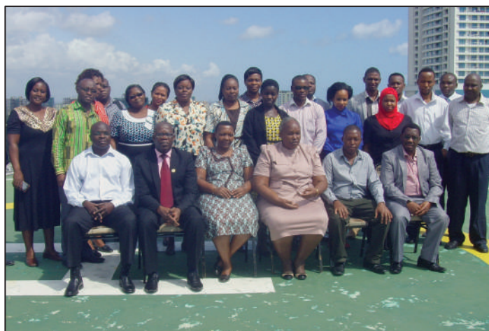
Tanzania's National Committee for the Prevention and Punishment of the Crime of Genocide, War Crimes, Crimes Against Humanity and All Forms of Discrimination

The Committee has conducted interfaith peace forums, peace programs involving civil society and political leaders, and tailored training and technical assistance programs to increase the capacity of the Committee to carry out its mandate. These tailored training programs have been supported by international civil society organizations, including AIPR, as well as the United Nations Office of the Special Advisers on the Prevention of Genocide and the Responsibility to Protect. The trainings took place in March and October 2014 and covered such topics as election violence, land conflicts, inter-religious tensions, and natural resource based conflicts. These training programs will continue in 2015.