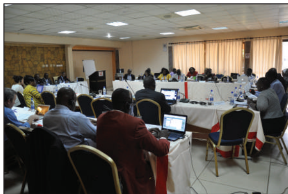
Members of the CAR and DRC National Committees attending a training seminar alongside members of other ICGLR National Committees

A national action plan for the Committee is currently being developed and will incorporate cooperation and communication with the ICGLR Regional Committee, and on the international level, with the UN Office of the Special Advisers on the Prevention of Genocide and R2P, the UN Office of the High Commissioner for Human Rights, and other partners such as AIPR. The Committee is made up of representatives from relevant governmental departments, civil society organizations, delegates from the provinces, and representatives from the private sector.