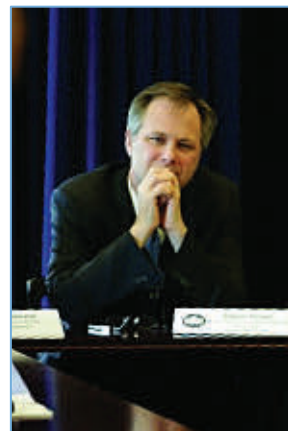
Stephen Pomper, Chairman, U.S. Atrocities Prevention Board

By the end of the three-day course, participants were better equipped to design a holistic strategy of prevention—drawing from the full array of early prevention and crisis management tools—to address the risk or occurrence of atrocity crimes in various conflict contexts. The training showed the commitment of the U.S. government to atrocity prevention, and in particular, the strong engagement of individual representatives to move from atrocity prevention in theory to atrocity prevention in practice. The course was the leading edge of a robust training program that will be offered to all civil servants working in the agencies represented on the APB.