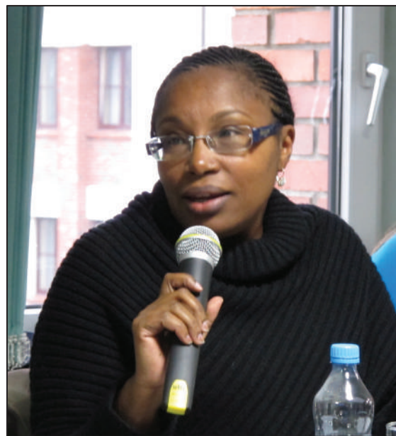
Alice Nderitu, Former Commissioner, National Cohesion and Integration Commission of Kenya; Member, Kenyan National Committee