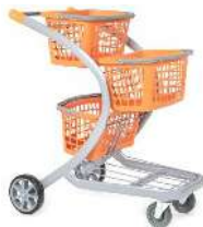
Boom V1 - Baby