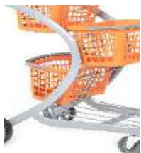
Boom V1 - Baby