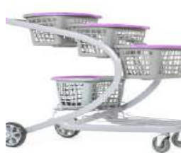
Boom V3 - Baby