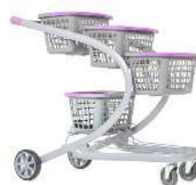
Boom V3 - Baby