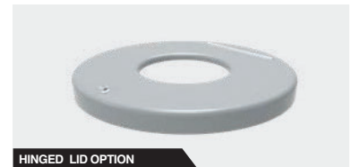
HINGED LID OPTION