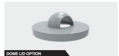
DOMED LID OPTION