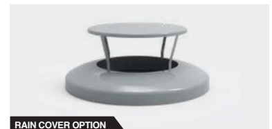
RAIN COVER OPTION