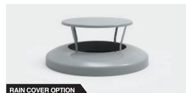
RAIN COVER OPTION