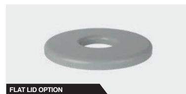
FLAT LID OPTION