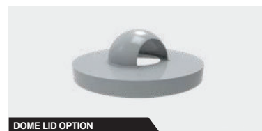
DOME LID OPTION