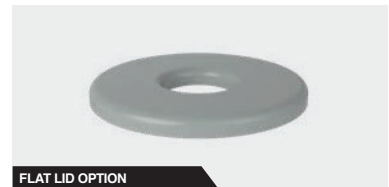
FLAT LID OPTION