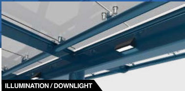
ILLUMINATION / DOWNLIGHT