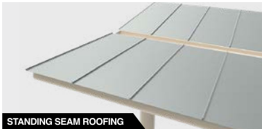
STANDING SEAM ROOFING