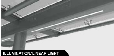
ILLUMINATION/ LINEAR LIGHT