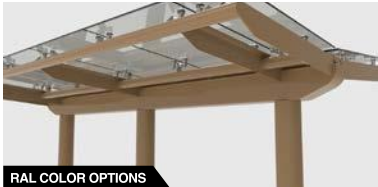
RAL COLOR OPTIONS