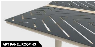
ART PANEL ROOFING