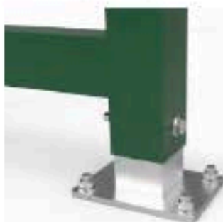
Ground Supports Quick installation with superior strength & durability