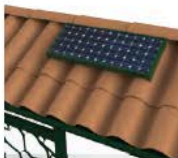
Solar Power We offer many off-the-grid power solutions.