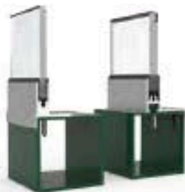
Window Panels Custom Extrusions allow for 1/4" or 3/8" Glass