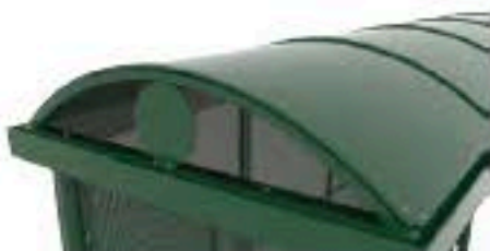
Roof Installation Designed to accommodate different roof styles