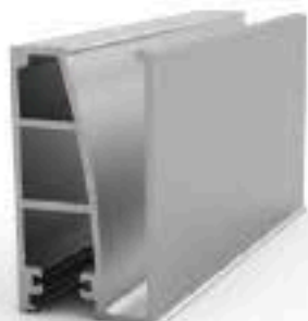
Mark IV Extrusion Equipped with paths for both electric and data cables as well as an integrated rain gutter.