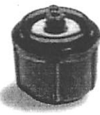
4.5 LEV Nozzle/Diffuser Part # 24291