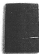
Sabre Front Cover Part # 14503