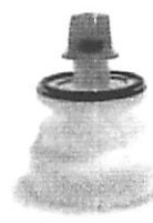
FFV Diffuser Part # 11373