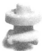
LEV 3.0 Diffuser Part # 28368

Refer to the chart below to determine which Coca-Cola Small Part you may need. Call 1-800-241-COKE (2653) and talk with a Customer Service Representative to order the part you need. Your order will be processed immediately over the phone and will be shipped directly to your location at no charge to you. This is another fast, easy and free program, that will also save you money.