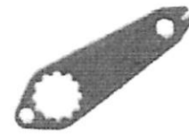
Nozzle Wrench Part # 11354