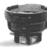
FFV Nozzle Part # 11588