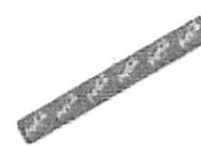
Line Label Part # Ask Tech