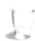
Flowmatic Nozzle Part # 27541