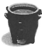
LEV 3.0 Nozzle w/Yellow O-Ring Part # 28545