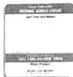
Natl. Serv. 800 Sticker Part # 14385