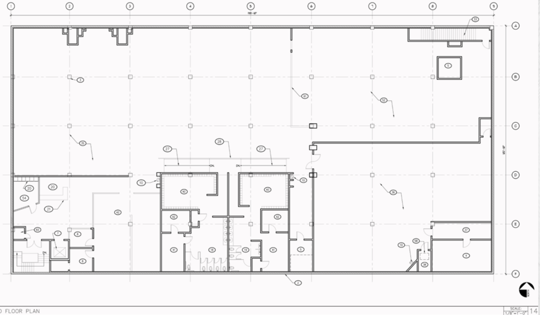
EXISTING SECOND FLOOR PLAN

Brand & California 240 N. Brand Boulevard Glendale, California