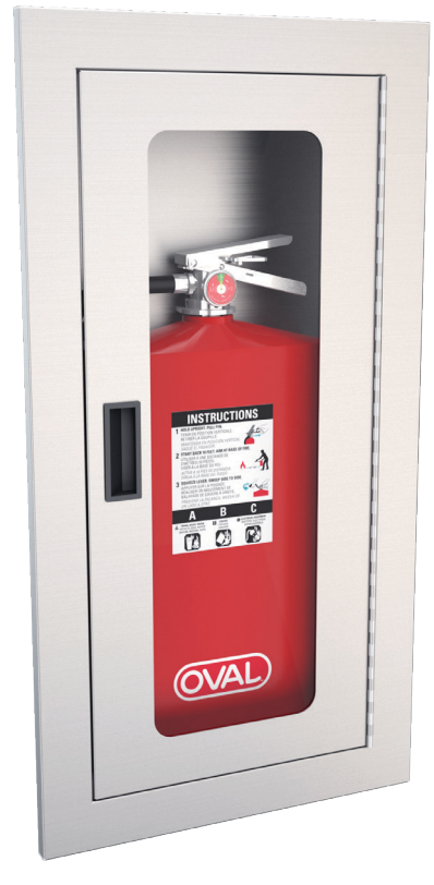
Shown with Oval model 10J-ABC fire extinguisher (sold separately).

Application: Recess mounted stainless steel cabinet for use with Oval Model 10J-ABC low-profile fire extinguisher (sold separately).