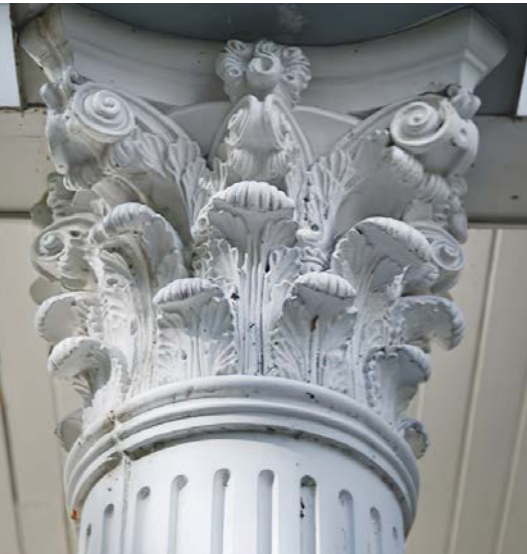
Image by Al Fritz. This Norland detail reflects an accurate understanding of the introduction of an acanthas leaf column in the Corinthian Order Drawing and Diagram illustrated by Sheri Macardy