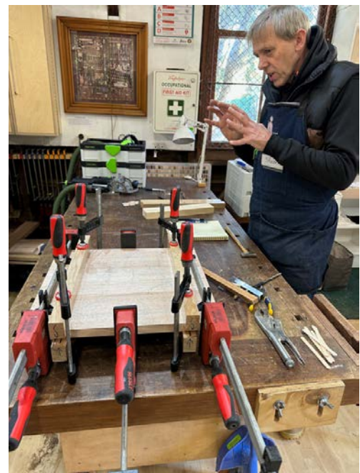
Clamping - make or break!