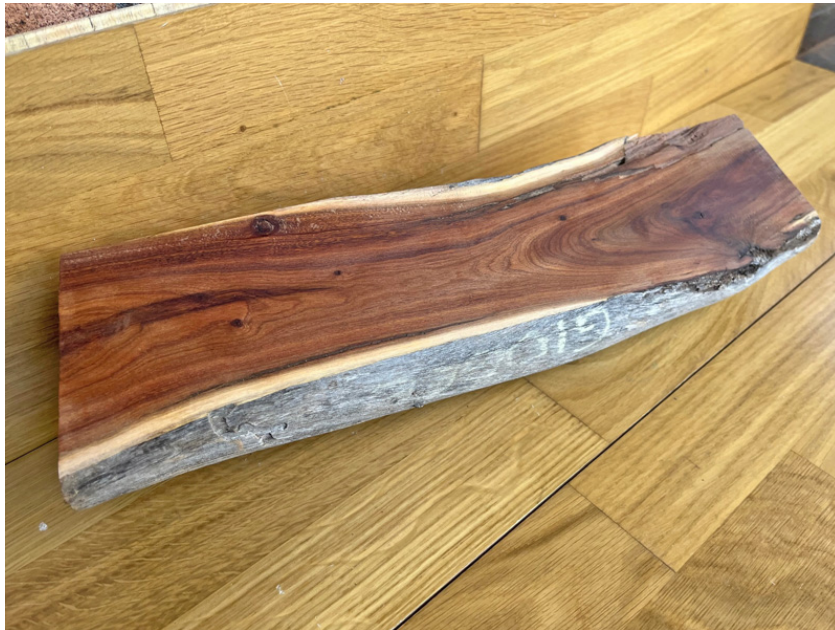
Gidgee log from a woodheap

The photos below show a gidgee log I collected (with permission) in June from a private woodheap near Quilpie, the top of a Huon pine box I made a while back using booked-matched ringed gidgee for the lid and ringed gidgee knife scales I put on a leatherwork knife I made.