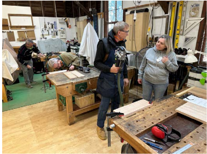
This is a Festool Domino machine...

Unfortunately we have no report from Stuart Faulkner's Domino course, but in view of Stuarts highly developed skills, it is safe to assume it was a great success!