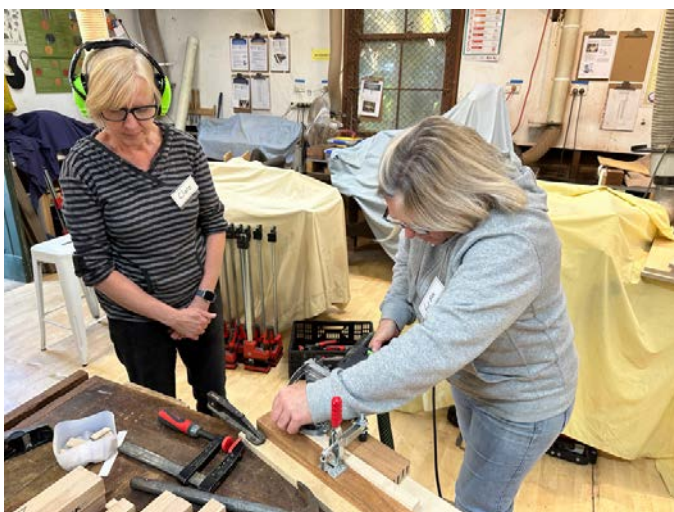
Making the "cut"