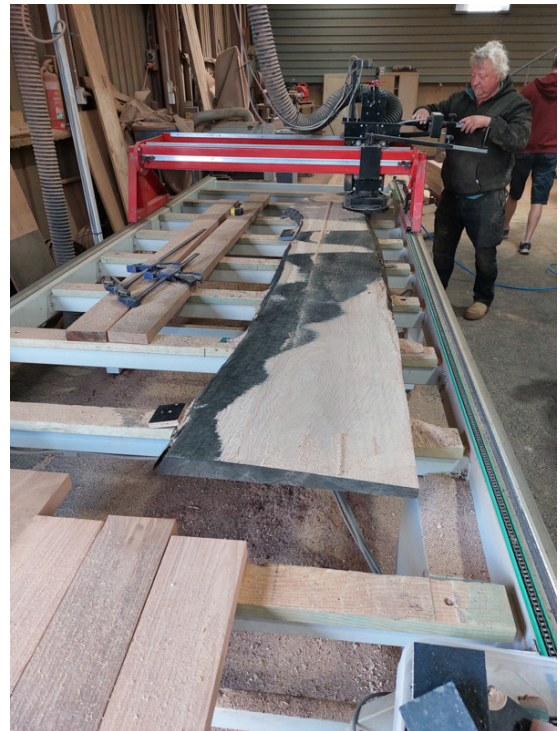
The amazing "Wood Wiz" thickener at work

Next we were shown the impressive Rubio Monocoat (single coat) product that we had all heard about, the