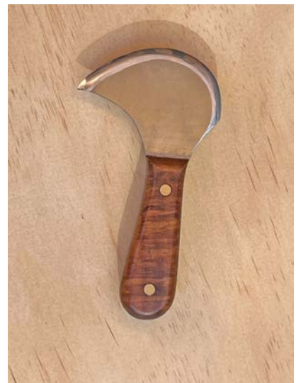
Ringed gidgee knife scales

What an incredible variety of timbers we have in Australia most of which are suitable for woodwork - from the heavy, hard and dense such as gidgee and mulga to the lighter, softer and less dense such as Australian red cedar.