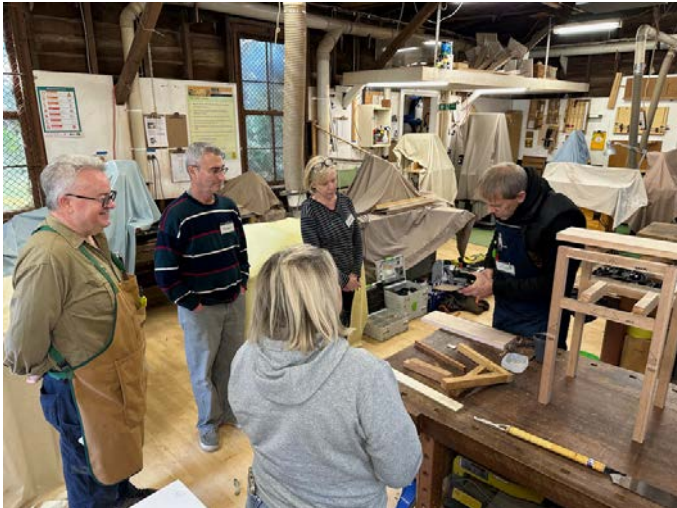
Pay attention to the adjustments