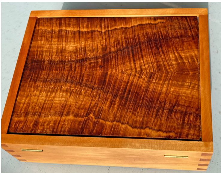
Book-match ringed gidgee box lid

On our travels throughout western Queensland, in addition to gidgee, I have been able to buy pieces of other slow growing and hard inland timbers including mulga, dead finish and budgeroo.