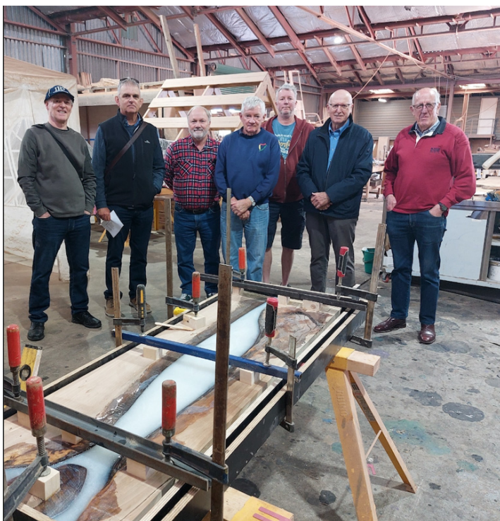
Members surrounding a river table with freshly poured resin

small quantity of hardener was measured and added using a syringe ! The Rubio tints come in a range of natural timber colours, but also some standout colours like the 'Peacock Green' used in the demonstration.... it certainly was a standout!