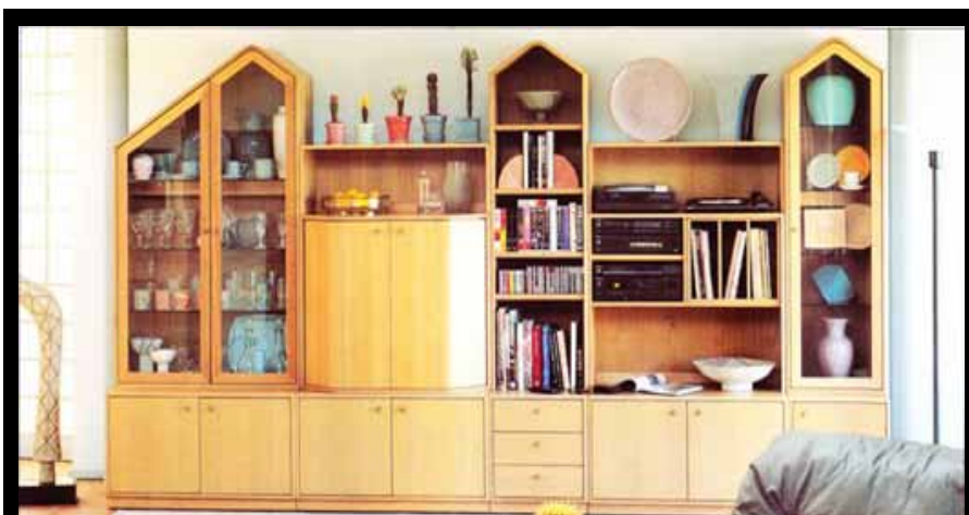
Modern 2000 series wall units in natural or smokey oak

A history of Parker Furniture: 1935-1995, by Alan Perry