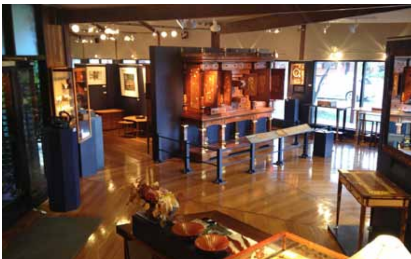
Above and below: Two inside views of the Bungendore gallery