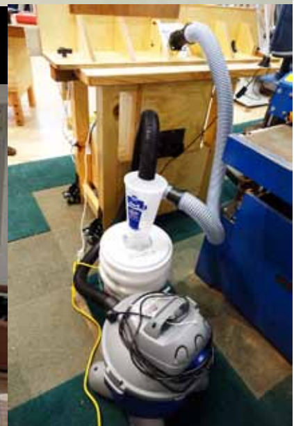
A ShopVac sucks dust away from the dust chute, passing through a dust deputy. Dust in the router cabinet is removed using the workshop's 4-inch dust hoses.