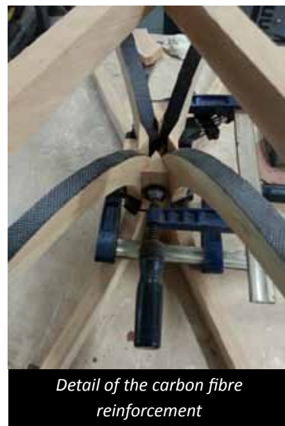
Detail of the carbon fibre reinforcement