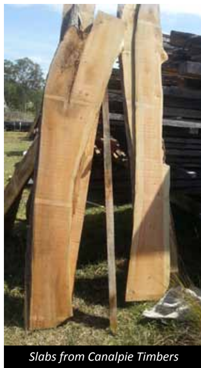
Slabs from Canalpie Timbers

Part way through construction I realised that the delicately curved legs may not have sufficient strength. But rather than re-make larger legs, which had already