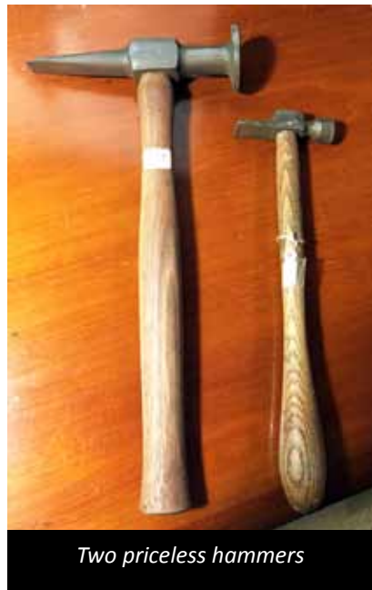
Two priceless hammers

But when we arrived there was no mess - just treasure.