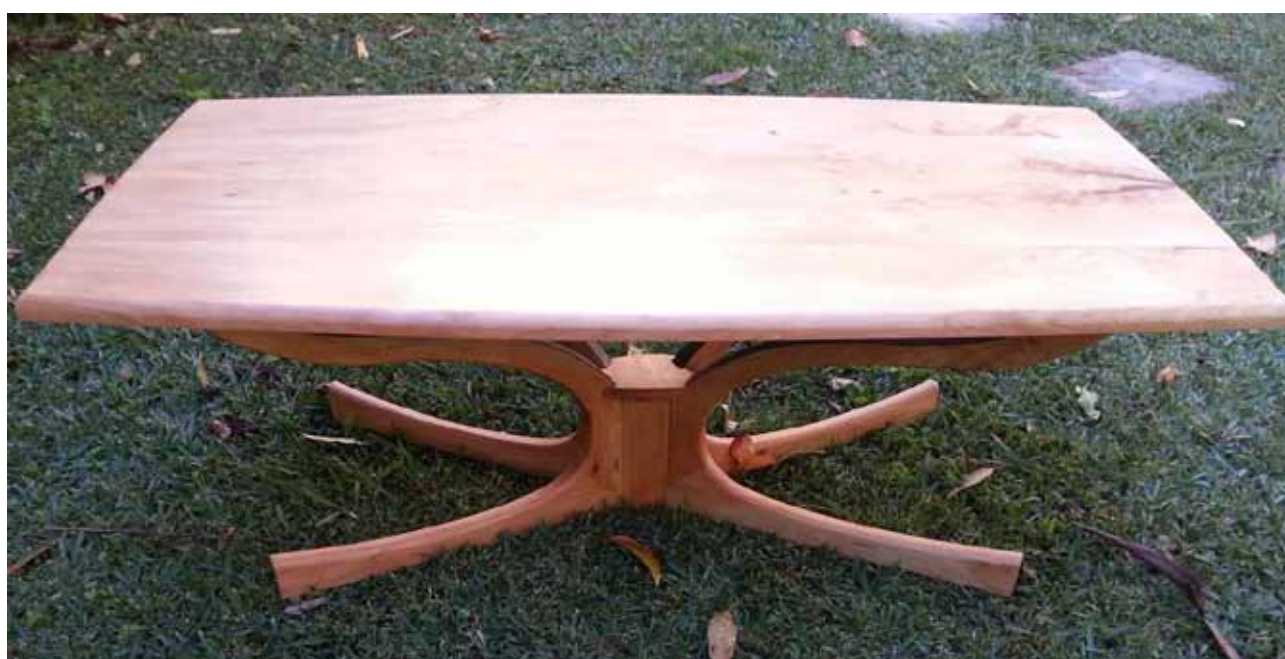
The finished table will be on display at the association's Lane Cove exhibition