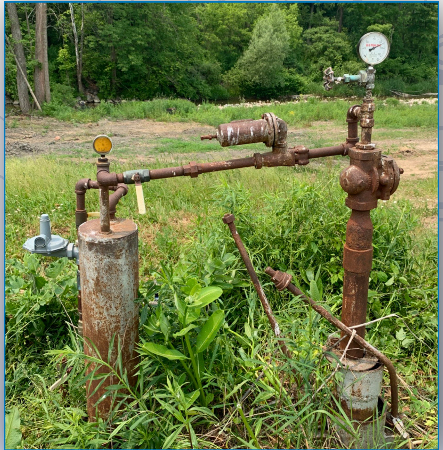
BEFORE CONSTRUCTION: Wanamaker 3 well, Town of Holland, Erie County