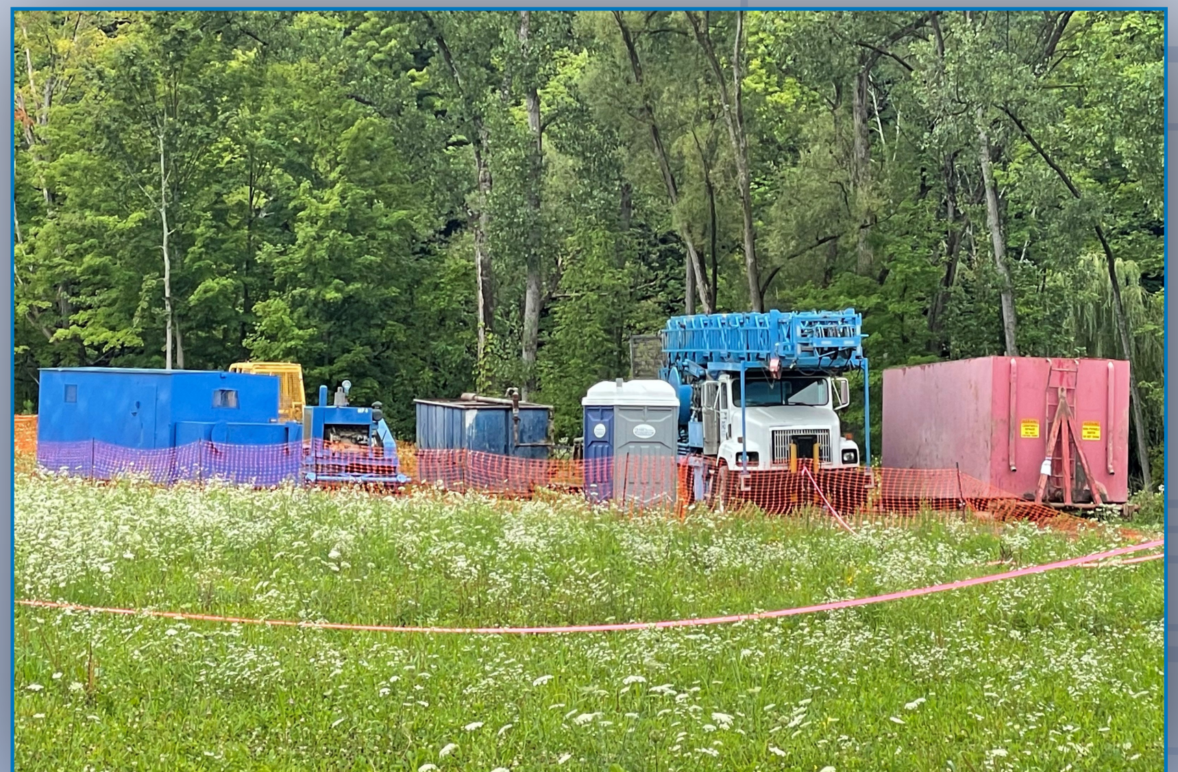
DURING CONSTRUCTION: Wanamaker well capping, August 2023.

PROJECT FUNDED BY President Joe Biden's Bipartisan Infrastructure Law