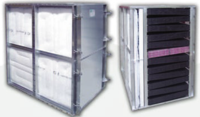
AAC Swiftpack® System