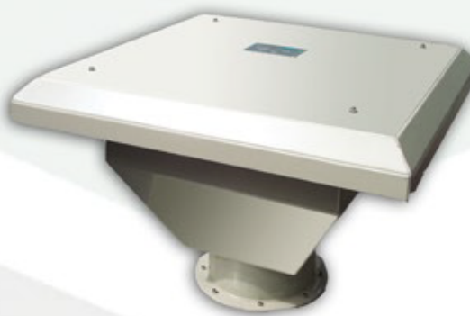
AAC PV Passive Vent