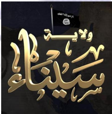
Islamic State Sinai Province Emblem