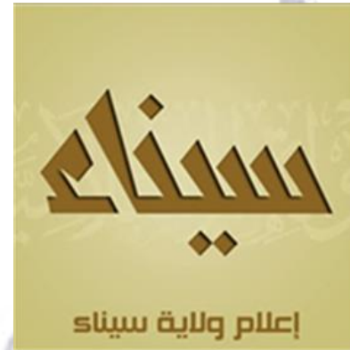
Sinai Province Emblem [IS Media Office]