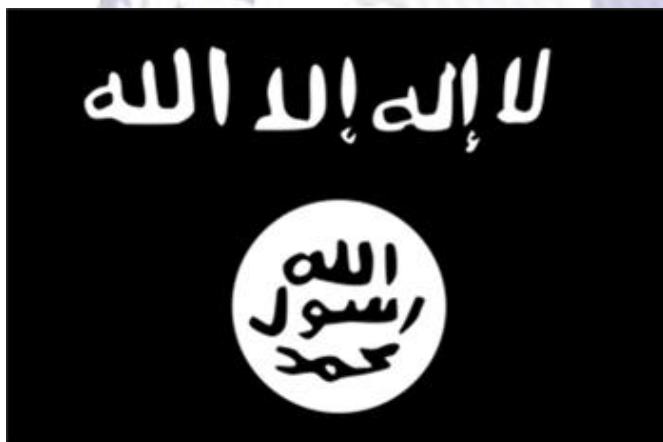
Islamic State Flag aka Black Flag of Tawheed, the Black Standard, Al-Rāya